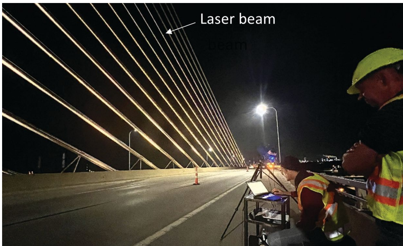
Figure 7. A laser vibrometer is used to collect data from the Veterans' Glass City Skyway deck during a coordinated lane closure to eliminate traffic-induced vibration noise.

at the lower ends, and that makes traditional accelerometers attached to the sheathing unreliable. Therefore, the team employed laser vibrometry to obtain measurements from the middle third of the stay cables, effectively bypassing the nonunified vibrations present at the lower ends. Laser vibrometry uses a laser to measure the natural frequency (vibration) of a cable; a simple equation is then used to calculate the force in the cable.