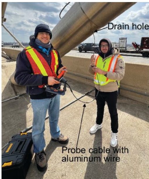
Figure 3. Dual-camera borescopes with four-way articulation are used for internal visual inspection through existing stay-cable drain holes.

confirmed the strands were in excellent condition (Fig. 4). The presence of fine dust rather than rust residue or mineral deposits indicated dry internal conditions. Furthermore, the specialized grease at the lower ends appeared stable and showed no signs of water emulsification or contamination.