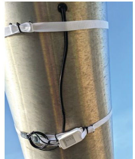
Figure 5. An internal humidity and temperature probe has been installed at the lower stay-cable termination through an existing drain hole to monitor the internal microclimate.

Consistency in stay-cable tension is a primary indicator of both stay-cable health and overall superstructure integrity. However, in ungrouted systems, the sheathing and strands may not vibrate as a unified mass