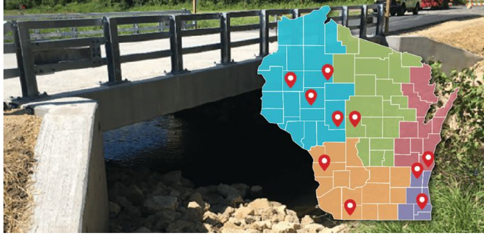
Single-span cast-in-place concrete slab bridges were designed and constructed throughout Wisconsin using standardized plans under a new pilot program. The inset map shows the locations of the 10 pilot projects, which were spread across the five regions of the state.

WisDOT BOS's development of the SBDT started in 2020 and was finalized for pilot-project use in 2021. Ten pilot projects representing the five regions of Wisconsin were identified, with construction slated for 2022 and 2023. As of publication of this article, all the pilot projects were designed, bid, let, and constructed with no significant issues identified within the process, designs, or plans. For these 10 pilot projects, savings of approximately 33% of average historical costs were seen in the design phase. Moving forward, WisDOT BOS has identified an additional 134 candidates for bridge-replacement projects scheduled for construction between 2023 and 2027 that fit the parameters of the SBDT. It is anticipated that