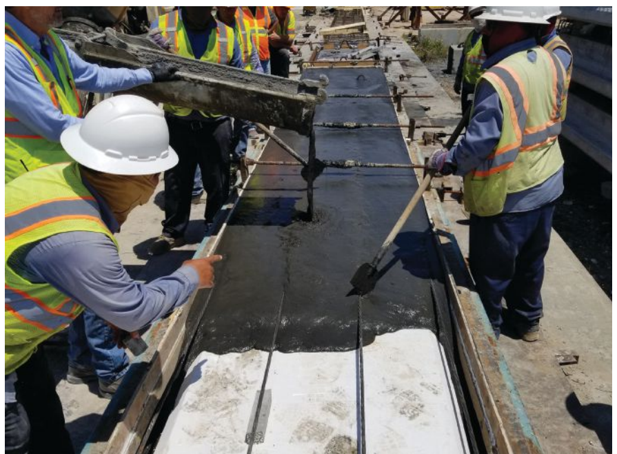
Appearance of ultra-high-performance concrete in its fresh state as it is used for testing (left) and beam production (right).