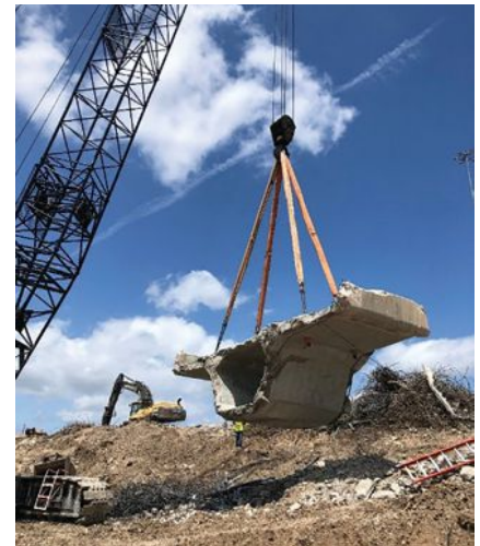
Figure 1. A component from a trapezoidal box-girder segment salvaged from the decommissioned Interstate 35/U.S. Route 183 direct connector is one of the first specimens in the Concrete Bridge Component Collection at the Concrete Bridge Engineering Institute.

Much of the initial work for CBEI was in the area of post-tensioning. An international benchmarking study on PT technology, in particular electrically isolated tendons (EIT), led to further