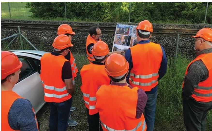
Figure 2. Participants in the Global Benchmarking Program trip in Switzerland.

The Concrete Materials for Bridges Program serves as the third pillar. The importance of proper concrete mixture proportions was recognized, as well as the need for broader understanding of the “whats” and “whys.” While structural engineers tend to focus on