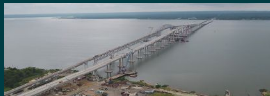
New Nice/Middleton Bridge , Newburg, Maryland to Dahlgren, Virginia, U.S. Design Build EOR for Skanska-Corman-McLean