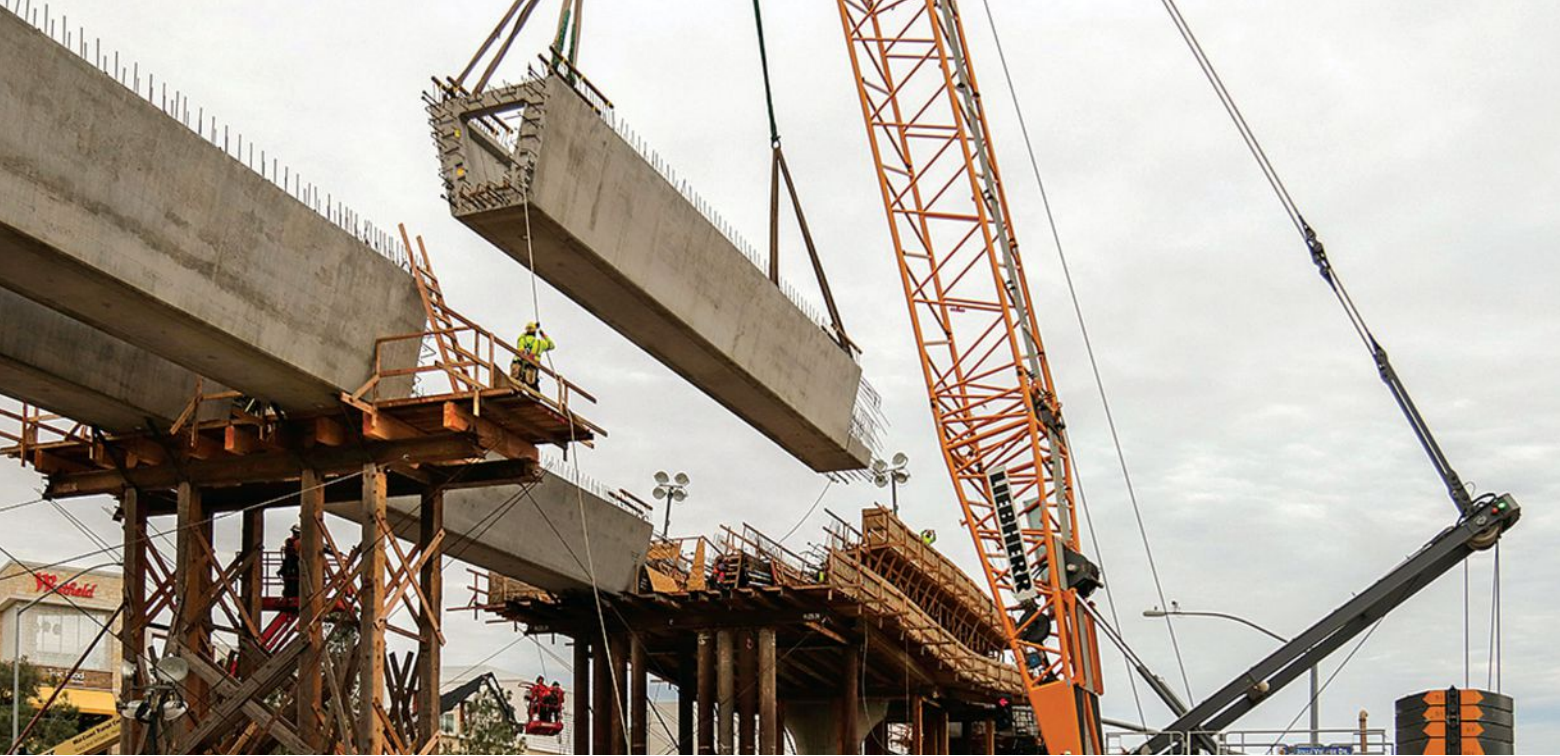
WSP designed the Genesee Avenue Viaduct in La Jolla, Calif. It was the first curved, spliced precast concrete U-girder light-rail transit bridge in Southern California. The use of precast concrete girders eliminated several months of nighttime closures. The construction of a straight section is shown here. (For more information, see the Spring 2020 issue of ASPIRE ®.)

involves assembling the available data for an asset, accessing that information throughout the planning process, updating it during design and construction, and maintaining it over the asset's lifetime.