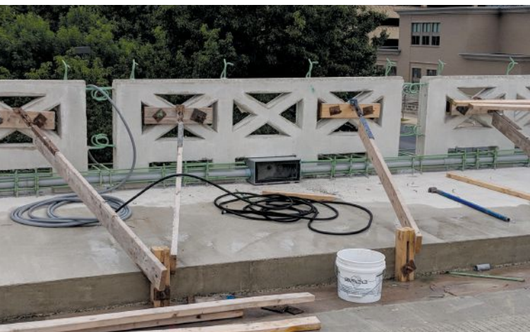
"Panel feet" were incorporated into the design of the precast concrete panels so that the feet could be placed directly on the sidewalk and the panels required only temporary lateral support before casting the posts, curb, and top rail.

Early on, the character-defining and aesthetic features of the bridge were identified: namely, its reticulated balustrades and outlooks. Originally, at each pier of the open-spandrel spans, an outlook extended from the sidewalk, allowing pedestrians to step away and enjoy the river scenery. However, in the 1950s, a major rehabilitation of the bridge included closing off these outlooks due to deterioration of the