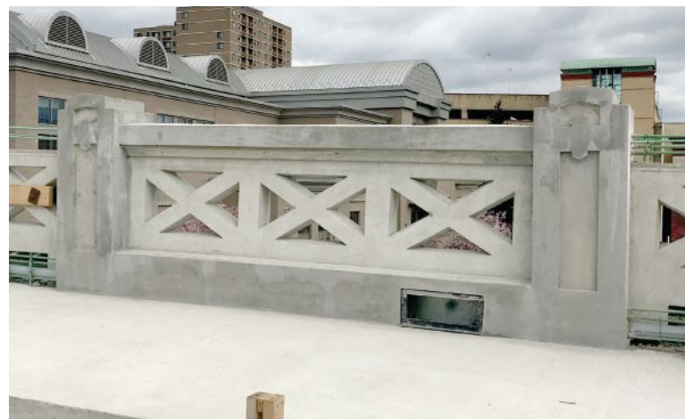
Typical precast concrete panel with cast-in-place posts, curb, and top rail. A conduit and a junction box for bridge lighting are visible.