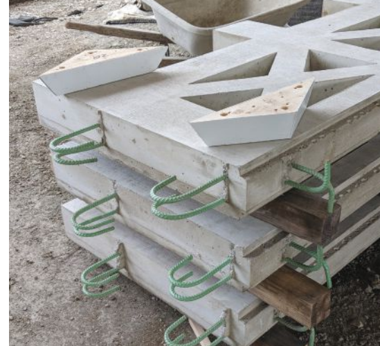
Precast concrete panels ready for erection. J-bars extending from top and sides of panels tie into cast-in-place posts and rails. Pieces of the reusable two-part blockout forms are sitting on the panels.

hands-on inspection of the bridge found that some of the original elements, including the existing deck, sidewalks, floor beams, and reticulated balustrades, were deteriorated beyond repair and required replacement. The original arch ribs, closed-spandrel arches, and piers were in good condition considering their age and could be rehabilitated with only concrete repairs. The rehabilitation