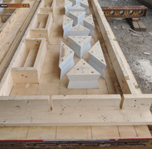
Reusable formwork for a precast concrete railing panel. Slots in end and top forms are for extended J-bars. The panels were cast on site under a span that could be closed to the public. Tarps were hung to control the environment.