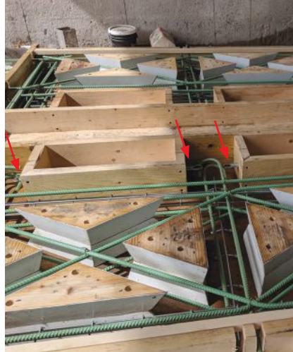
Two panel forms with epoxy-coated reinforcement installed, including J-bars extending from the top and sides of the panels to tie into the cast-in-place posts and rails. Inserts embedded in sides of the panel feet (see arrows) are for installing longitudinal reinforcement to tie panels to the sidewalk reinforcement.