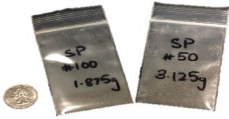
Figure 4. Five grams of crushed aggregate for T-FAST.