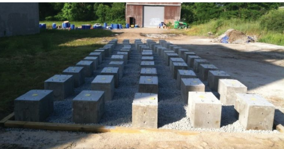
Figure 6. Block farm of concrete specimens. The physical dimensions of the blocks are periodically measured to determine expansions.

ic concrete mixture, so that everything that will be in the concrete is accounted for in the test.