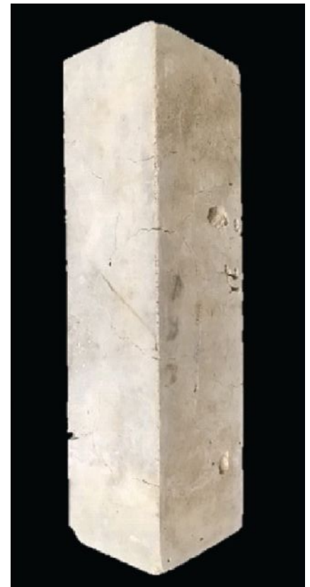
Figure 3. A 3 × 3 × 11.25-in. concrete specimen for an ASTM C1293 test.

At the end of the test period, the contents of the tube are filtered and the filtrate analyzed for silicon, calcium, and aluminum. The analysis is used to calculate the reactivity index (RI), which is the concentration of silicon divided by the