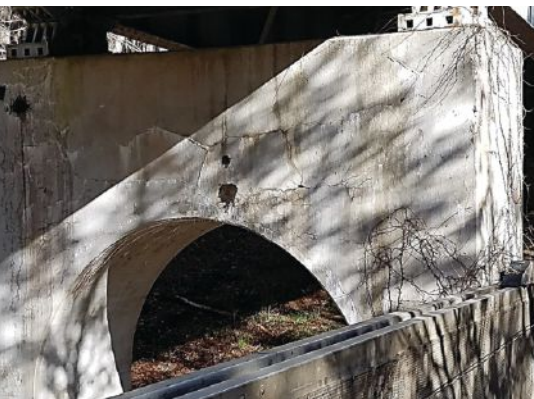
Figure 1. Cracking in a concrete bridge pier caused by alkali-silica reaction.

also shown, for the first time, that aluminum plays an important role in the expansion of these gels.