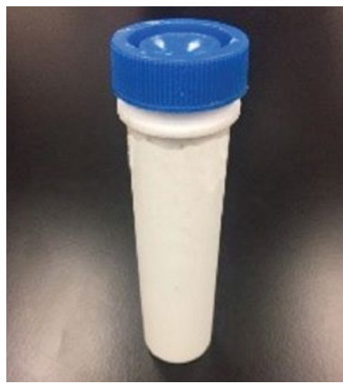
Figure 5. A 50-mL polytetrafluoroethylene (PTFE) test tube is placed in an oven at 55°C for 21 days to determine the reactivity index of the test aggregate in the T-FAST test.