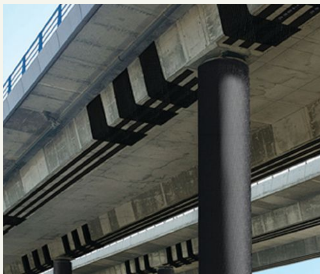
Figure 2. Strengthening of concrete bridge elements using carbon-fiber-reinforced polymer systems bonded to the concrete, which appear as black bands or wraps in the photo.

Although FRP composites offer many advantages, these systems do have certain disadvantages and limitations