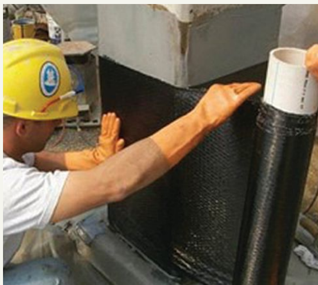
Figure 3. Flexible carbon-fiber-reinforced polymer sheets can be wrapped around and bonded to almost any concrete element profile.

that should not be neglected by engineers. Examples of such limitations are the linear-elastic behavior of FRP composites, which leads to reduced ductility of the material; different thermal expansion coefficients for FRP materials compared with concrete; and their low maximum temperature threshold, specifically related to the epoxy resins, which could cause premature degradation in case of fire. Additionally, careful consideration should be given during design to determine reasonable strengthening limits for the FRP composite system. The design guides and codes described in the following section outline the required minimum capacity of the unstrengthened structural member and other guidelines regarding the condition of the structure. For example, the American Concrete Institute's (ACI's) Guide for the Design and Construction of Externally