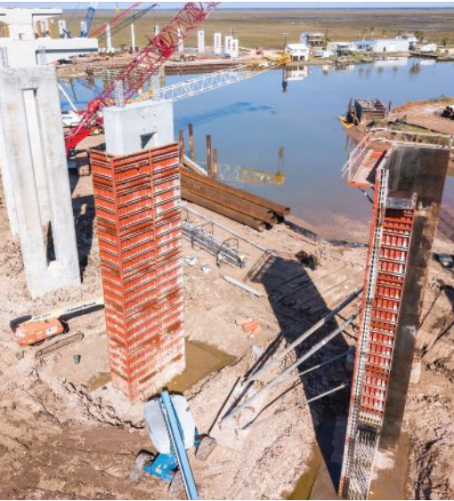
Crews cycle column formwork for piers for the Sargent Bridge replacement in Matagorda, Tex. PERI developed a custom form allowing concrete to be pumped in from the bottom to achieve a single-phase concrete placement on these hollow columns.

a girder while maintaining flange widths can be achieved by adding on pans to the side forms. It will get the job done but, depending on if it is an adjustable-height form using risers, the quantity of individual pans coupled with the need to bounce back and forth between web thicknesses may make it more cost effective to purchase a separate form.