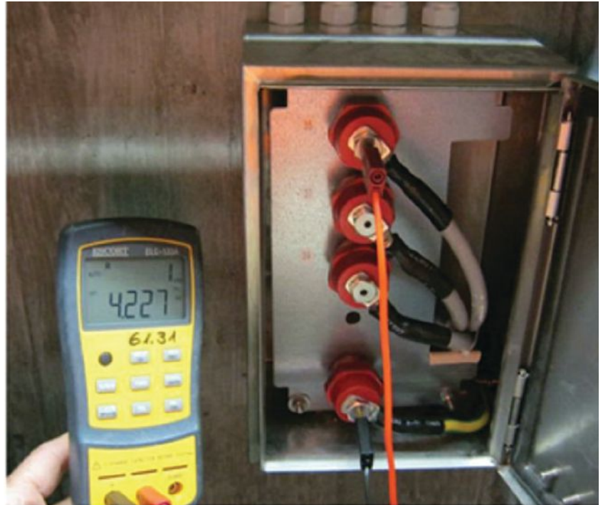
An example of a post-tensioning system where electrically isolated tendons have been implemented. Wire conductors lead from mild reinforcement (top left) and a strand anchor head (bottom left) to a junction box where an LCR meter is used to measure impedance (right).