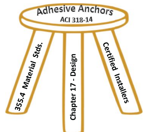
Figure 1. There are three legs to the adhesive anchor quality stool: the design procedure in ACI 318-14 Chapter 17 2 (or Article 5.13 of the AASHTO LRFD specifications 1 ), the qualification protocol in the ACI 355.4 material standard, 4 and an operational installer certification program. Figure: Neal S. Anderson.

Think of designing an adhesive anchor like a milking stool (Fig. 1): you need three legs for it to be stable.