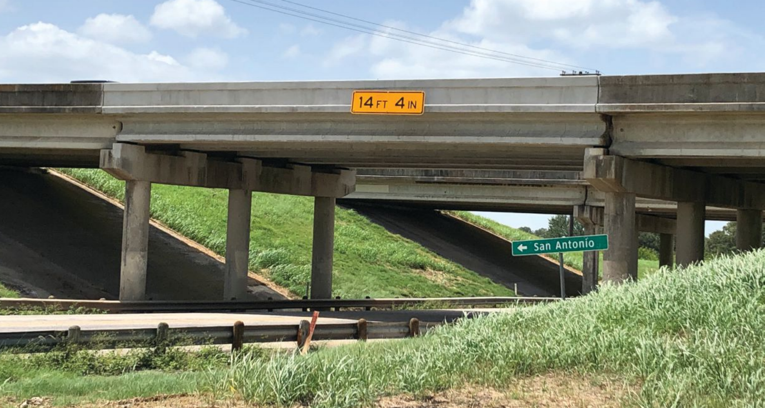
The replacement of the damaged span of eastbound Interstate 10 was completed in 11 days. The Texas Department of Transportation opted to replace the entire span rather than repair or replace only the damaged section.