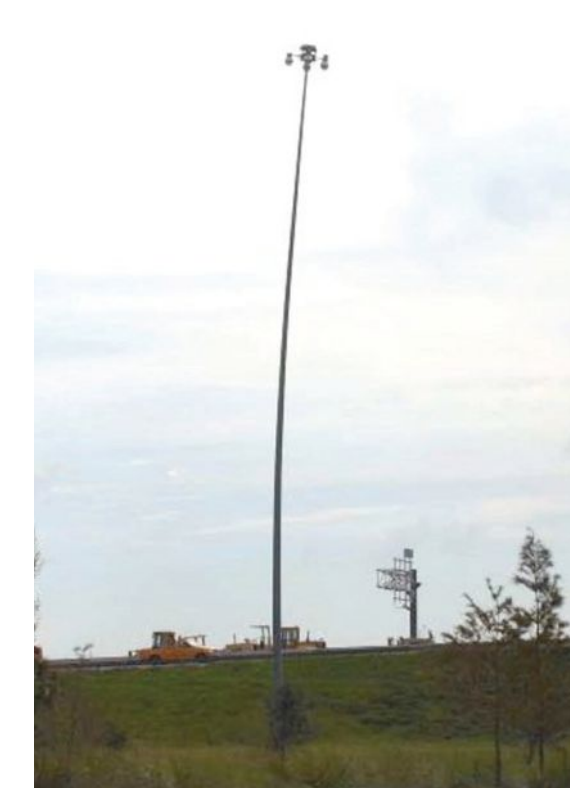
Figure 1. Florida Department of Transportation photo showing high-mast illumination pole during a high wind. All Photos adapted from Reference 2.

The overall strength and stiffness implications for shafts damaged by ASR have been previously discussed in great depth.<sup>2-4</sup> A complete review of these issues is beyond the scope of this article. In our tests, foundations with ASR cracks performed adequately and the capacities of the anchor rods were not compromised by severe cracking resulting from ASRinduced expansions with the reinforced detail used by TxDOT. Furthermore, reinforcing bars located slightly above,