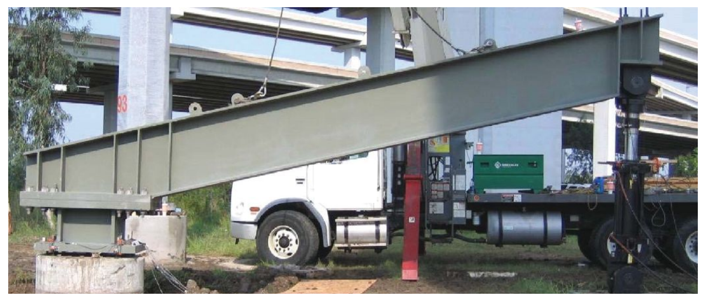
Figure 3. Setup for field testing the deep anchors in the ASR-damaged drilled-shaft foundation of a high-mast illumination pole.

bars made with carbon steel decreases as pH values increase.