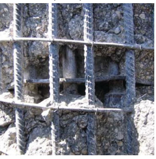
Figure 4. No corrosion of the reinforcement was evident in the drilled shafts having significant cracks likely caused by ASR.

anchors. More specifically, the tensile and compressive loads on the deep anchor rods were transferred to the neighboring longitudinal reinforcing bars with the help of the spiral (confinement) reinforcement. Simple strut-andtie models were used to explain the structural response.<sup>4</sup> The viability of the load transfer relied on the integrity of the struts forming in the structural core and the presence of the confining reinforcement providing restraint against radial blowout forces.