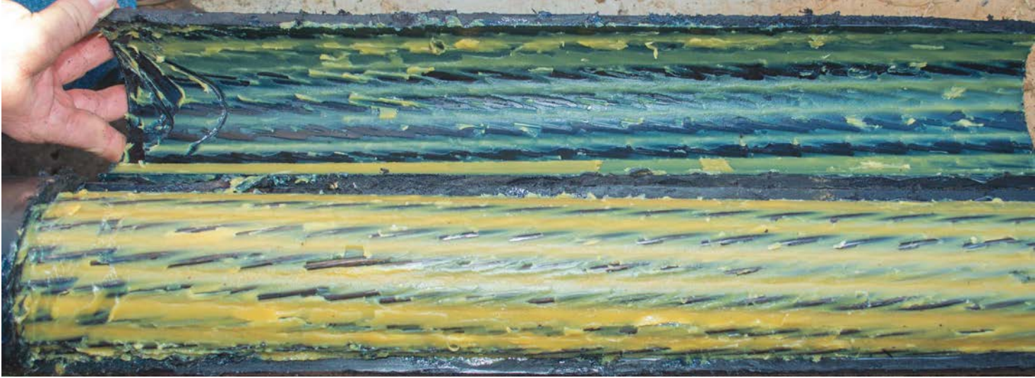
Tendon using flexible filler. Flexible filler can be used in both external and internal tendons.

tendons. Computation of tendon stresses from global displacements is sufficiently complex that Article 5.6.3.1.2 of the AASHTO LRFD specifications includes simplified equations for predicting the ultimate stress in unbonded tendons. Once the ultimate tendon stress is calculated, the nominal flexural resistance is computed using the same equations as for bonded tendons. The equations in Article 5.6.3.1.2 are based on research at the University of Texas that tested a scale model of a three-span segmental bridge with external unbonded tendons. 2 The test model used grouted external tendons running through rigid pipes in deviators to achieve the draped profile. It should be noted that, although the tendons were grouted within the pipes, some slip between the pipe and deviators was observed. Therefore, the equations are based on the tendon length between anchorages, with the effective tendon length being further dependent on the number of hinges expected to form within a given span. While the testing that was used to develop the current AASHTO LRFD specifications equations was specific to a typical span-by-span bridge of the time, it is this author's opinion that these equations provide a reasonable estimate for ultimate tendon stresses for most situations involving 100% unbonded tendons, including external tendons and internal tendons using flexible filler.