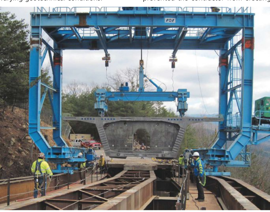
Due to the steep terrain at the site for Bridge 2, a temporary trestle/falsework system was constructed to support a gantry crane to erect the precast concrete segments. The gantry is lifting a pier segment in this photo. The access hole in the segment is visible.

Bridges 9 and 10 were constructed using CIP segmental, balanced-