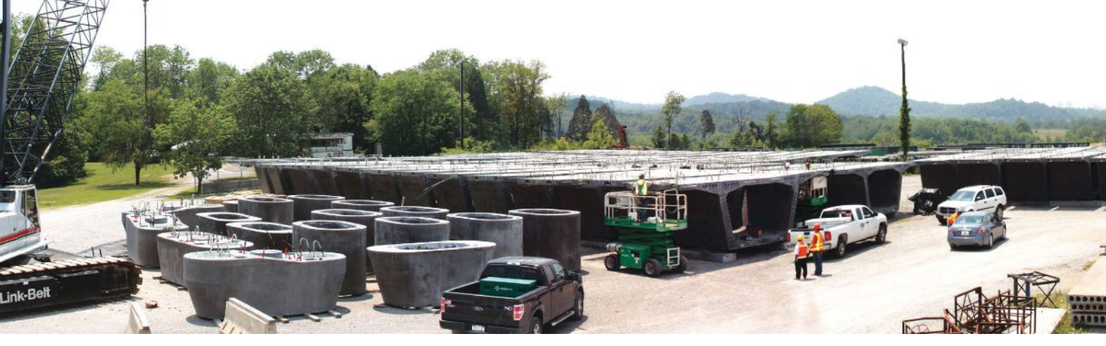
Pier and superstructure segments for Bridge 2 in the precast concrete yard.