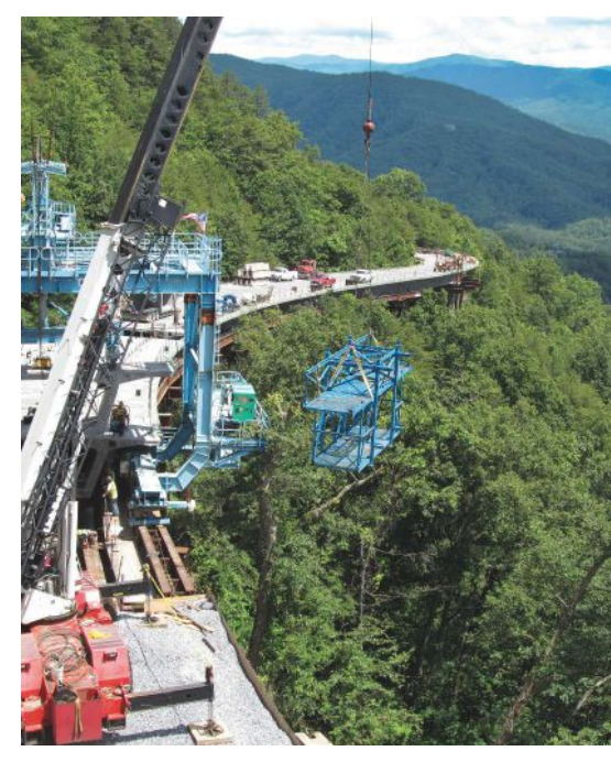
Segment erection as Bridge 2 nears completion.