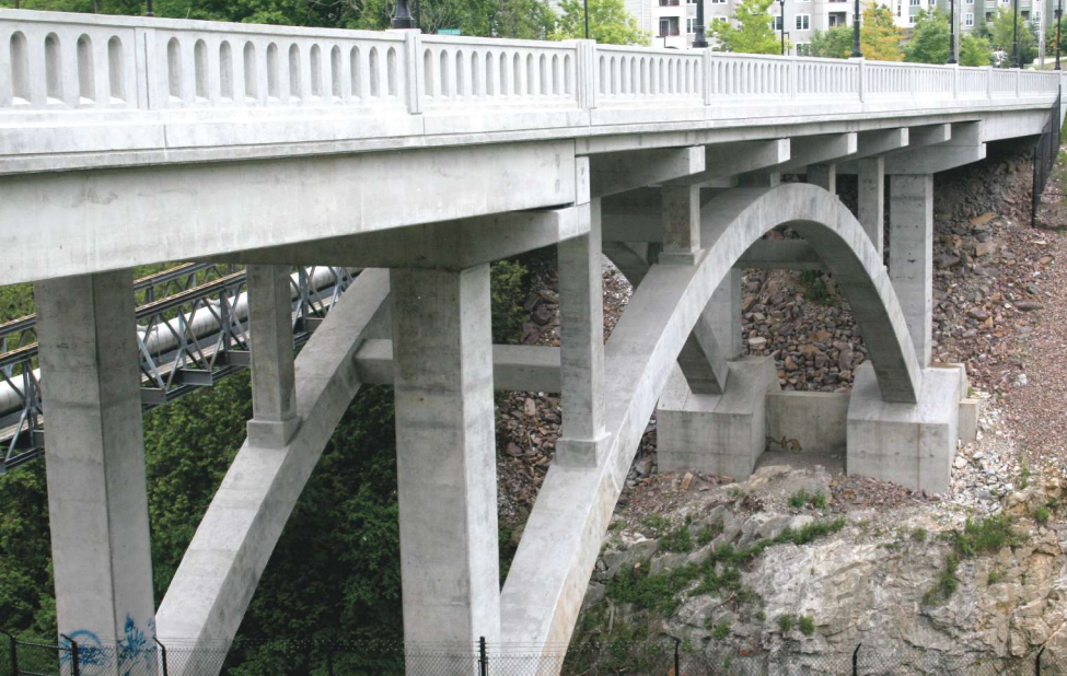
In an effort to replicate the aesthetics of the original Lime Kiln Bridge over the Winooski River Gorge, which was one of the first open-spandrel arch bridges in the United States, designers used precast concrete beams along with cast-in-place concrete arches, piers, floor beams, and deck. Special attention was paid to the visual depth of the arch spans, the depth of intermediate spans, and the post spacing on railings.

with towns to ensure that, within reasonable limits, schedules and designs are adaptable to their needs. Some towns in high-tourist areas want to avoid construction in the summer, while others want to build in the summer and avoid disruptions during the school year. Balancing those needs and using ABC helps shorten construction periods for all.