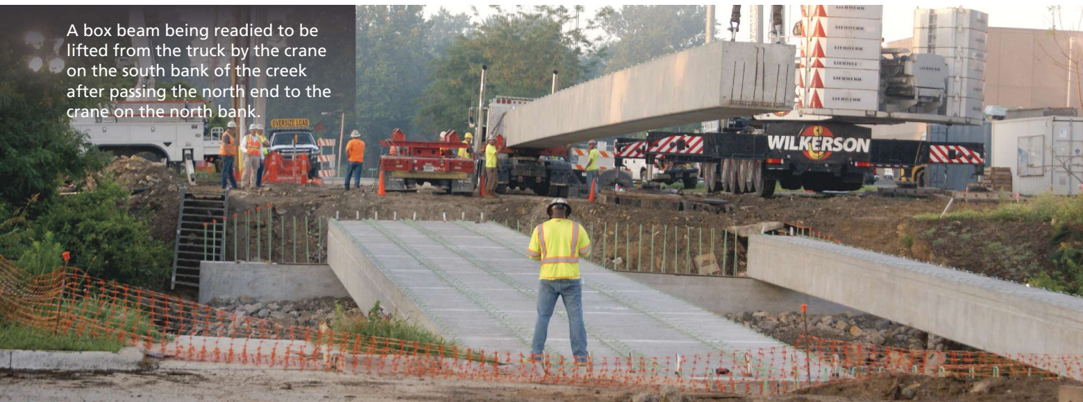
A box beam being readied to be lifted from the truck by the crane on the south bank of the creek after passing the north end to the crane on the north bank.