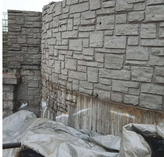
Formliner used on inside and outside corners.

of 2016, no movements were detected nor any other adverse effects to the existing buildings.