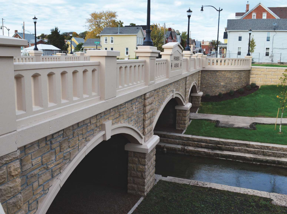
Rhomberg Avenue Bridge creates a gateway experience.

approximately 200 ft, and presence of fine to coarse sands with standard penetration test (SPT) blows per foot ranging from about 10 to 15 through the majority of the driven pile length. The nominal axial bearing resistance for construction control was determined from a noncohesive soil classification and a geotechnical resistance factor of 0.55. The required nominal axial bearing resistance was 127 tons for the abutment piles, and 120 tons for the pier piles at the end of pile driving, which required a wave equation analysis for pile driving (WEAP) with bearing graph.