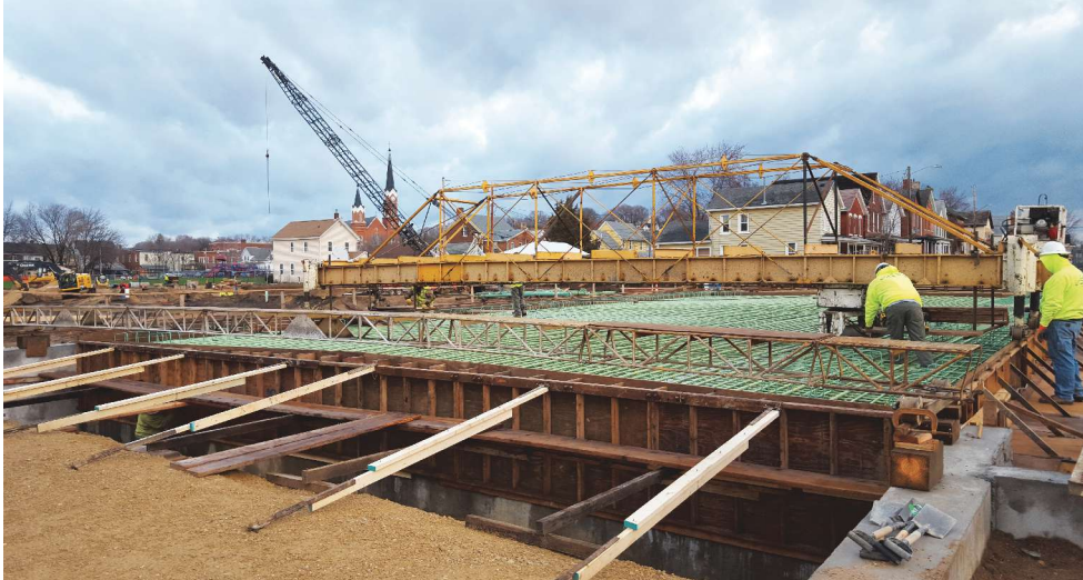
Superstructure under construction.