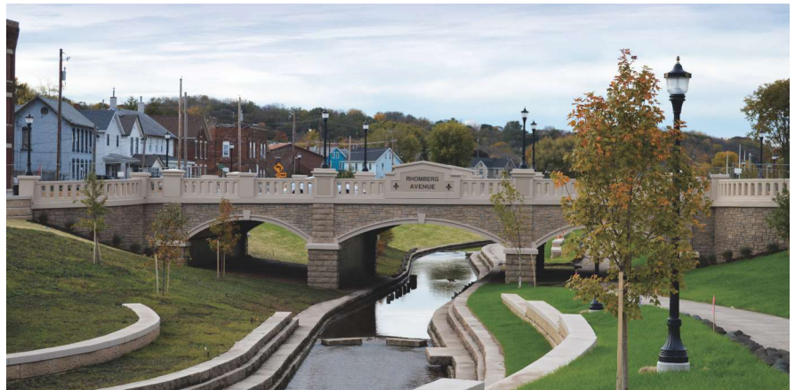
Completed Rhomberg Avenue Bridge.

In the fall of 2008, the design for the Bee Branch Creek Restoration was initiated. In order to understand the community’s vision for the project, the design team held a series of