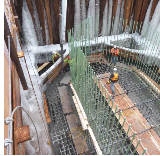
An early foundations contract was used to accelerate construction of the river pier foundations.

Construction on the new bridge began in July 2014, and the construction team worked through the winter of