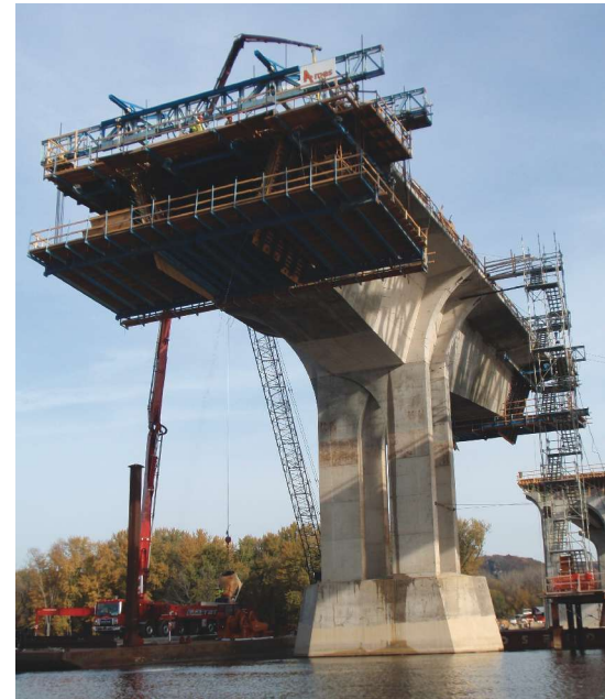
The main river spans utilized the cast-in-place balanced cantilever construction method.

The concrete box-girder structure type was selected for the new bridge based on criteria that included assessment of the visual impact to the historic bridge. Since 1941, the graceful historic cantilever through-truss had become an iconic structure in Winona. Preliminary