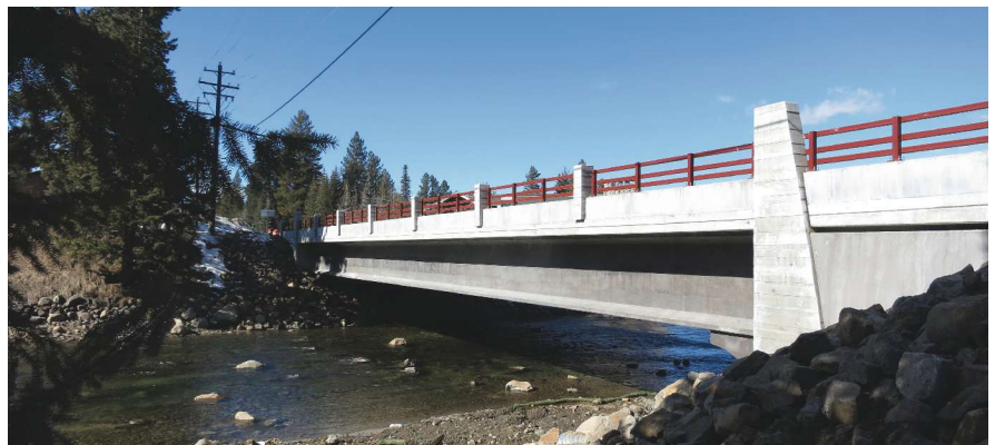
The 158-ft-long, single-span Lardo Bridge features 90-in.-deep precast, prestressed concrete girders and aesthetic details.