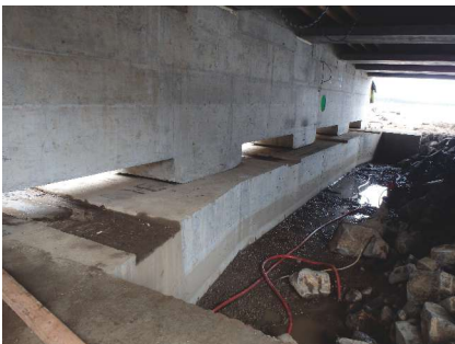
Lochner used nonproprietary equipment to slide into place the Lardo Bridge, carrying State Highway 55 over the North Fork of the Payette River in McCall, Idaho.

The system allows the team to adapt to design and constructability issues as well