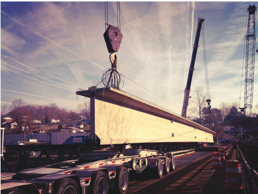
The concrete beams of the Coopers Creek Bridge were long and would have been heavy, but the design-build team specified lightweight concrete to both reduce the weight and minimize the crane size.

A number of concrete bridges have been completed as design-build projects, including the Van Metre Ford Bridge, which replaced a historic stone bridge (retained as a pedestrian