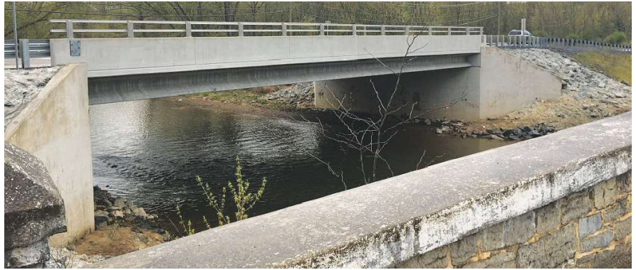
The Van Metre Ford Bridge (above and below), a design-build project, contains prestressed concrete hybrid bulb tees with a 40-in.-wide bottom flange that allows more prestressing strands to be used.

Precast/Prestressed Concrete Institute 200 West Adams Street | Suite 2100 | Chicago, IL 60606-5230 Phone: 312-786-0300 | Fax: 312-621-1114 | www.pci.org