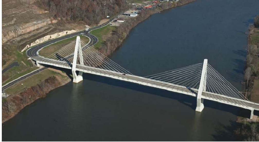
The Bridge of Honor over the Ohio River is a cast-in-place segmental concrete cable-stayed bridge designed and built by the Ohio Department of Transportation and then turned over to the West Virginia Department of Transportation for operation and maintenance.

A new paradigm has been created with the construction of the Kanawha River Bridge, completed in 2010, which produced a record span for a cast-in-place segmental box-girder structure (see article in Winter 2009 issue of ASPIRE ). The 2975-ft-long concrete design with a 760-ft-long