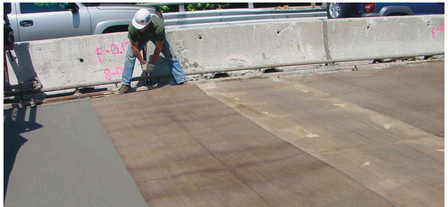
Application of wet curing immediately after finishing the concrete surface and continuing wet curing for at least seven days are successful practices to reduce bridge deck cracking.

Practices tried by some states to reduce shrinkage and shrinkage cracking