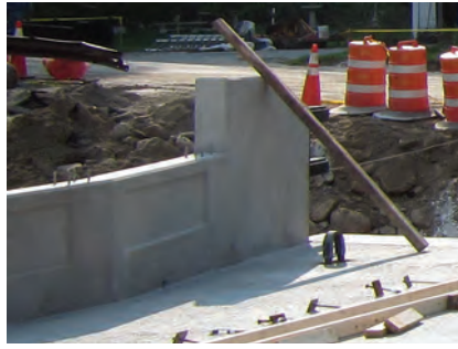
Precast concrete flare for historic rail.