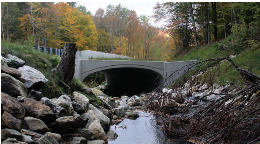
Completed Bridge 13 on VT 73 near Rochester, Vt.