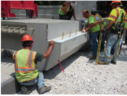
Concrete curtain walls were precast on each end of NEXT beams for Bridges 15 and 16.

semi-integral curtain walls cast onto the superstructure also allowed the bridges to be designed as a “strut,” thereby mobilizing earth pressure, where needed, to resist longitudinal forces imparted on the superstructure instead of resisting the forces solely by the substructure, further reducing the demand on the pile groups.