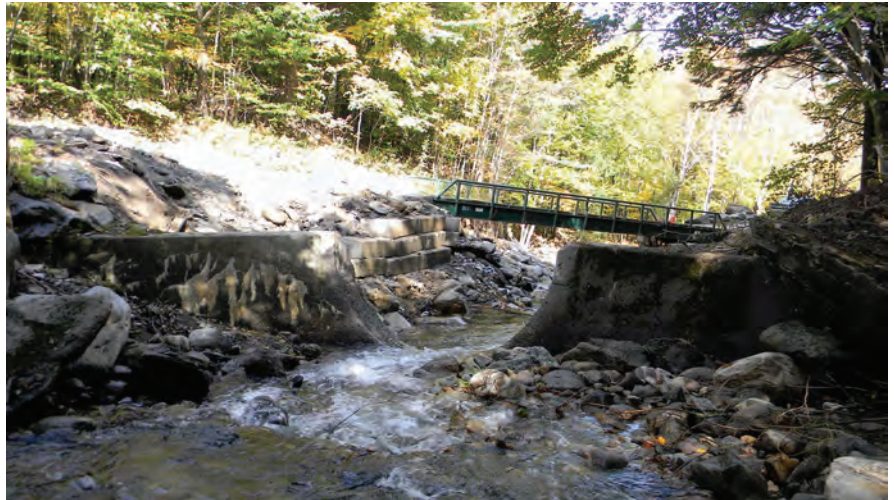
Bridge 13 on VT 73 near Rochester, Vt., following Tropical Storm Irene.

Prior to the storm, Bridges 13 and 19 were considered in fair condition and, therefore, had not been programmed for replacement. Initially, this made it difficult to prioritize their repair among other infrastructure projects. There was also the matter of how to allocate scarce funding. Luckily, these structures were eligible for emergency relief funding, but this also placed significant time restrictions on the design and reconstruction of both structures. In addition, Bridges 15 and 16, which were also located on VT 73, had been previously programmed for replacement. Because they were entering the project definition stage at the same time, there was an opportunity to leverage a consistent and coordinated approach