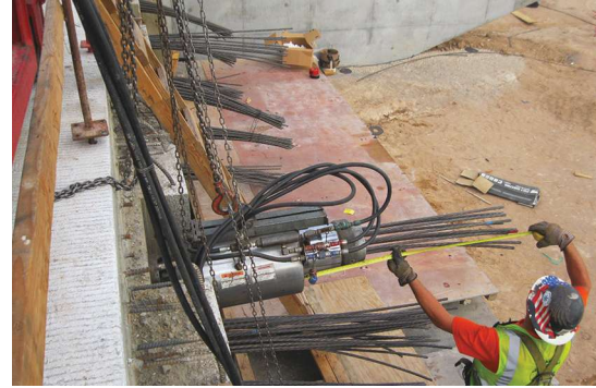
Post-tensioning for Ramp SE.

The horizontal and vertical alignments of the freeway-to-freeway ramps were also refined. The largest and tallest bridge on the project (Ramp