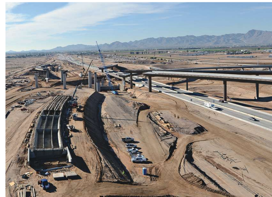
North half of flyovers completed. I-10 detoured to completed westbound roadway with the southern section of bridges approaching I-10.