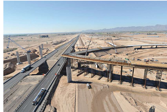
Ramp SE and Ramp EN where the new I-10 was shifted to the south to allow for construction of ramps from the north. Note the soffit fill usage of the lower profile Ramp SE.