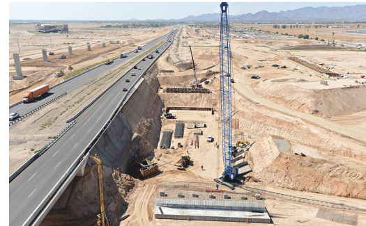
Excavation for foundations of Ramp SE and Ramp EN adjacent to I-10.