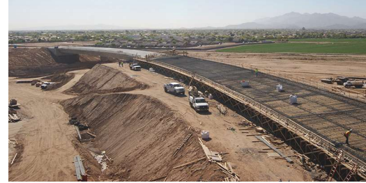
Use of excess material as soffit fill for one of the lower profile bridges.

Post-tensioned, box-girder bridges offer uniform simple lines, a relatively shallow structure depth and integral pier caps, which make for an aesthetically pleasing structure.