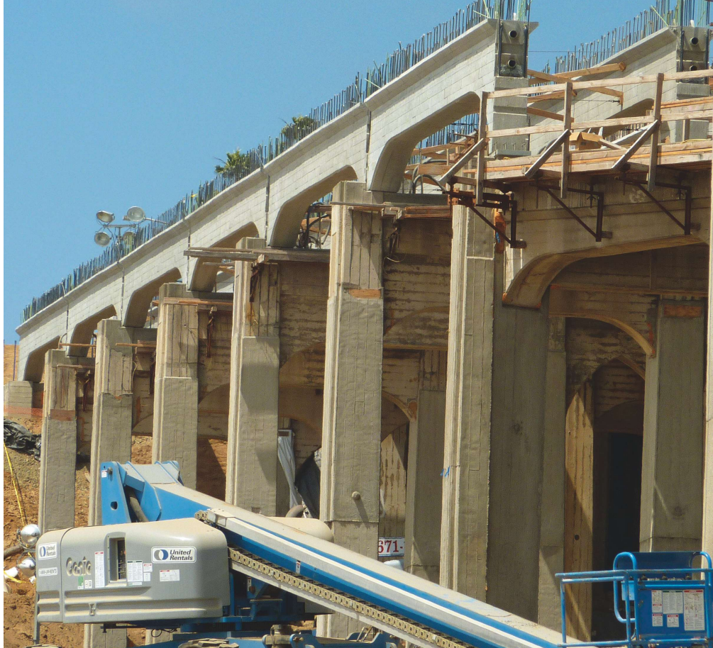
Precast concrete girders erected on rehabilitated substructure.