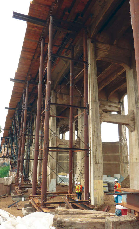
Temporary bridge widening adjacent to environmentally sensitive area.

bridge's eligibility for listing on the National Register of Historic Places.