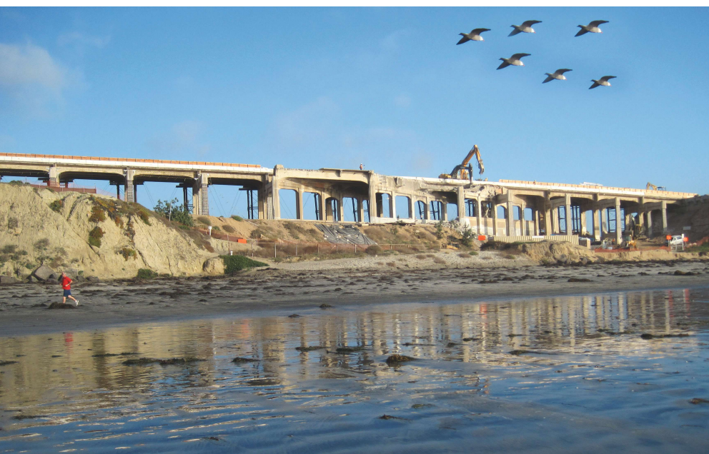
Pacific Ocean in front of bridge during superstructure demolition.

Prior to post-tensioning, the pretensioned concrete girders were capable of carrying AASHTO HL-93 live loading; however, post-tensioning the girders provided continuity for lateral seismic loads and also increased the girders' vertical capacity to carry the weight of California's permit vehicles. While a cathodic protection system will protect the substructure elements, the partially isolated superstructure relies on epoxy-coated reinforcing steel, increased concrete cover, limited water-cement ratios, and concrete admixtures to resist chloride penetration and reinforcement corrosion.