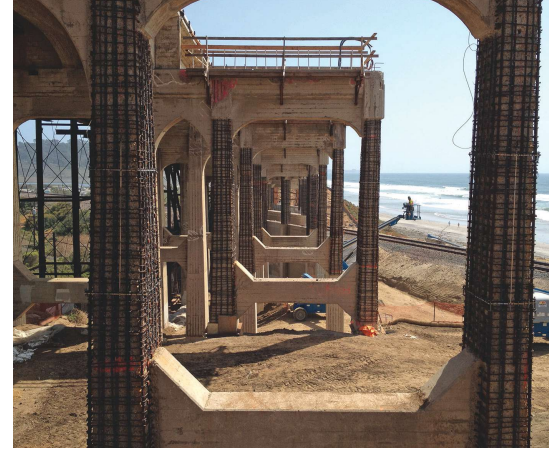
Installed column ties after removal of cover concrete.