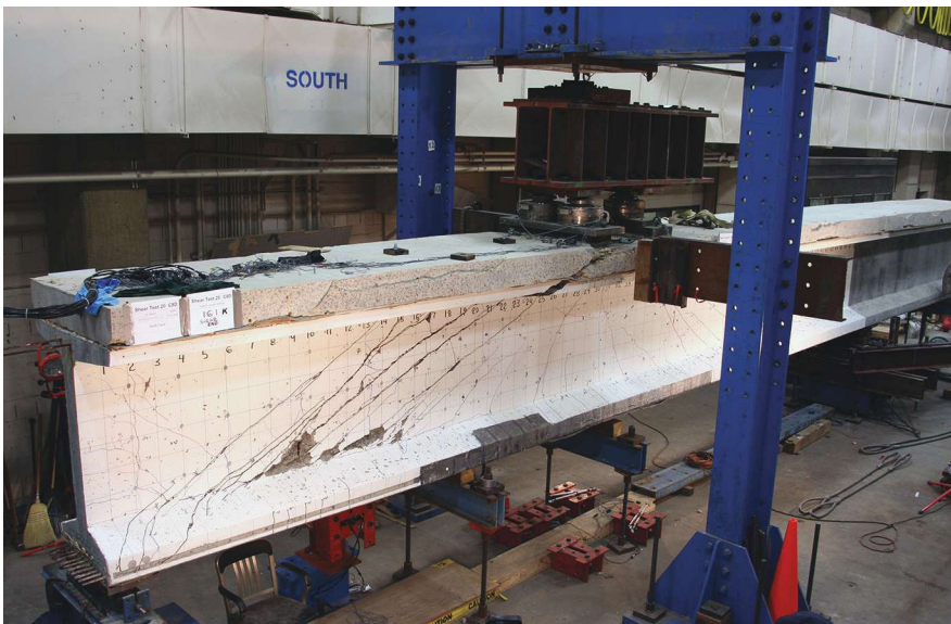
Shear testing of lightweight concrete prestressed girder.

Many service and strength limit state provisions throughout Section 5 rely on the tensile strength of the concrete as a key parameter in the predictive expressions. Most commonly, these expressions inferred the tensile resistance of the concrete through the use of a \sqrt{f'_c} term. The approved specification revisions implement a framework that allows the reduced tensile strength of LWC to be addressed by defining a modification factor