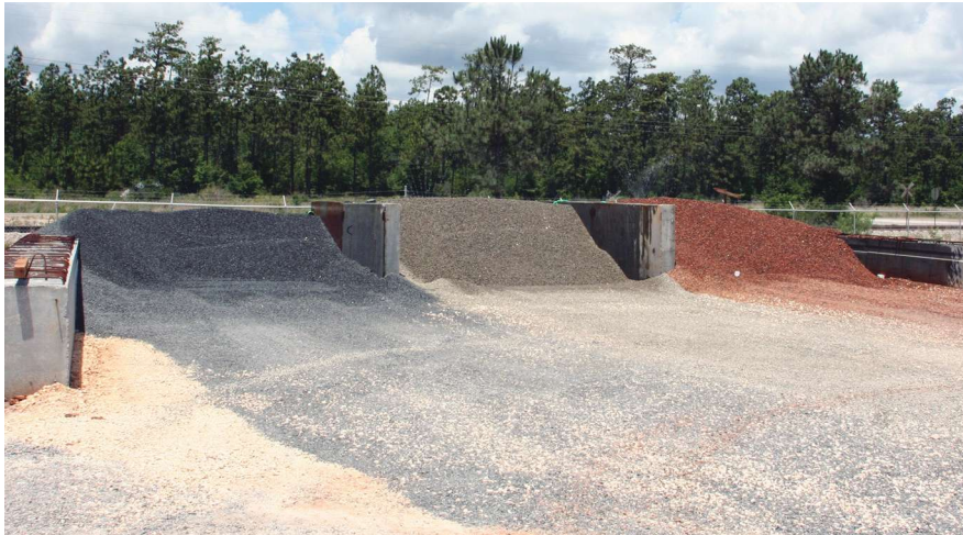
Lightweight aggregate stockpiles at precast concrete plant.