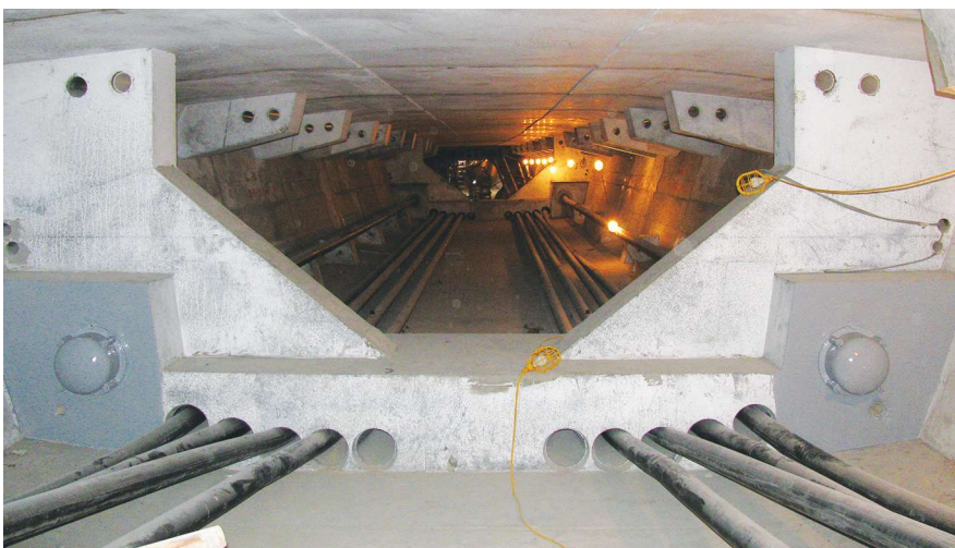
Deviation segment showing the diabolos with external tendons installed.