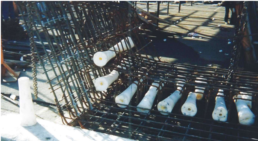
Diabolo void forms placed in a precast concrete segment.

pipe deviation saddle, and its fabrication, and the associated issues with alignment, bend tolerances, and duct connections. Installation of the external post-tensioning ducts is greatly simplified as the prefabricated continuous duct is routed through the diabolos in the deviation segments, and inserted into each anchorage diaphragm. The duct is then ready for the strands to be installed.