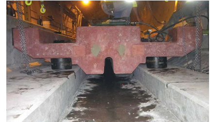
The University Link Extension features a 440-ft-long stretch of vibration-damping rails under Capitol Hill that “float,” or rest, on 7.5-in.-thick elastomeric isolation bearing pads.