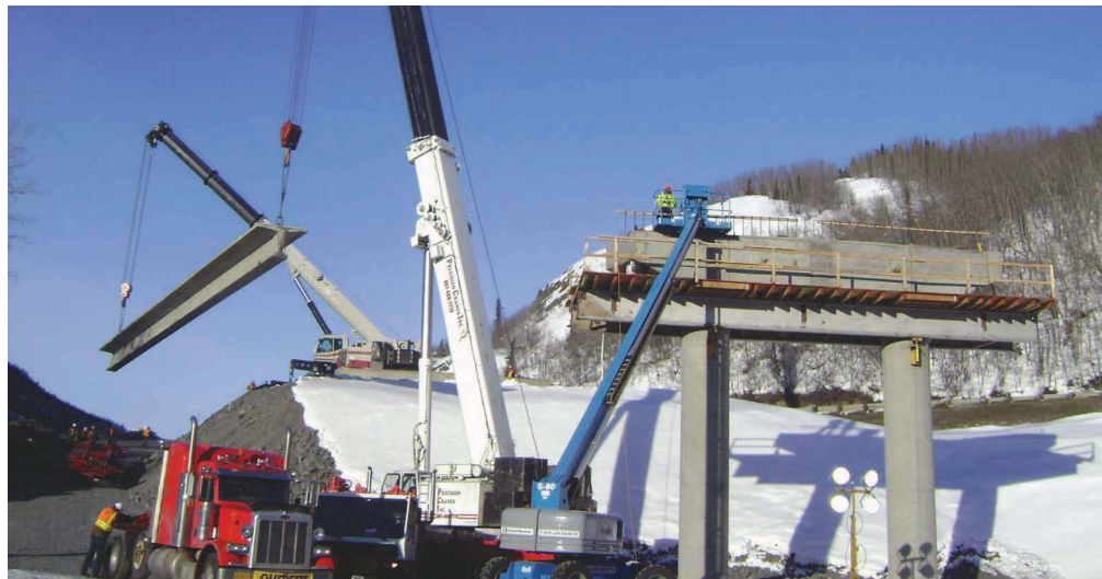
Picking a bulb-tee girder for winter construction of the Hicks Creek Bridge.

marks the 50 th anniversary of the 1964 Good Friday Earthquake, North America's largest recorded earthquake (moment magnitude 9.2). Besides the four minutes of shaking, the subsequent liquefaction, landslides, tsunami, and aftershocks contributed to the loss of life and extensive property damage. The Alaska Earthquake Information Center estimates that damages totaled $300-400 million in 1964 dollars.