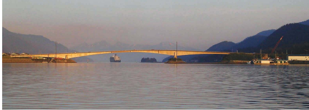
The Gastineau Channel Bridge, as seen from a kayak at sunset.

Another significant consideration when designing bridges in Alaska is the state's high seismicity. Alaska is the most seismically active state in the United States and earthquakes in the state have released nearly 25% of all of the world's earthquake energy over the last century. This year