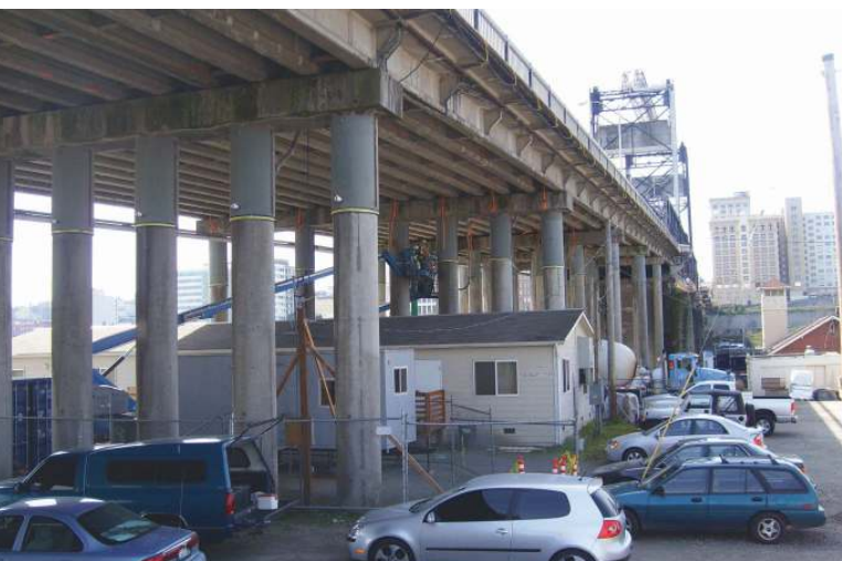
Murray Morgan Bridge port approach with repairs to the tops of the columns in place.