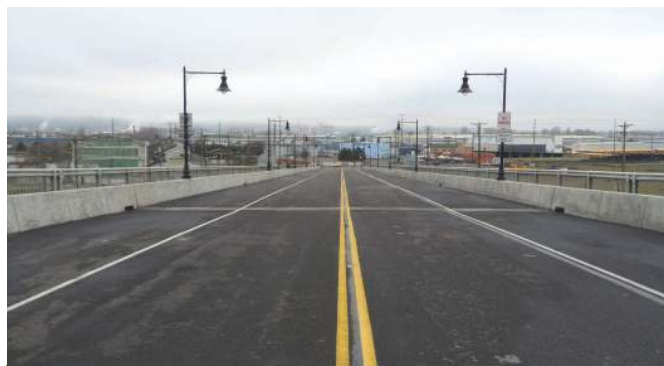
Murray Morgan Bridge port approach looking east – final deck and lane configuration.

The design-builder developed a unique solution within the boundaries of the project's performance specifications to repair the hollow precast, prestressed concrete columns of the substructure. The solution utilized a two-component, rigid polyurethane system of poured structural foam to support the interior faces of the hollow concrete columns, while the exterior faces were repaired and encapsulated. The 2-lb density foam had a compressive strength of about 0.3 ksi when fully cured and sufficiently supported the interior faces of the