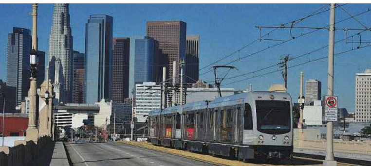
Completed bridge with the Los Angeles skyline.

A unique set of challenges was posed by the modification of the existing bridge to accommodate a double track light rail transit corridor and meet current design standards; construct the widened portion; and re-use the triumphal arches while maintaining traffic on the bridge, local roads, and 15 sets of live railroad tracks.