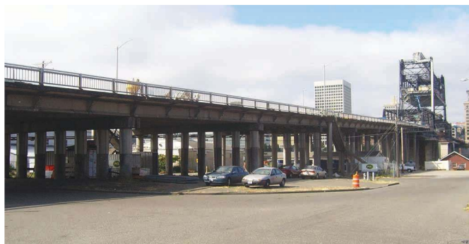
Murray Morgan Bridge port approach looking southwest.

hollow columns during construction. The structural foam also increased confinement capacity of the columns in the plastic hinge zones, which improved the seismic response of the structure.