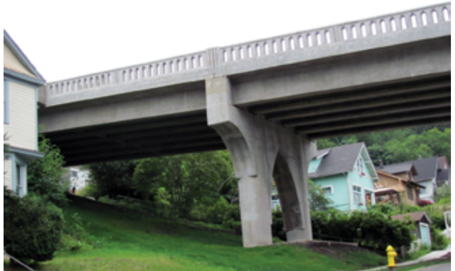
The two-span bridge has a decorative railing consistent with the appearance of the historic neighborhood.

The bridge lies just yards away from several homes; noisy, messy work was performed right outside people's bedroom windows. Given the