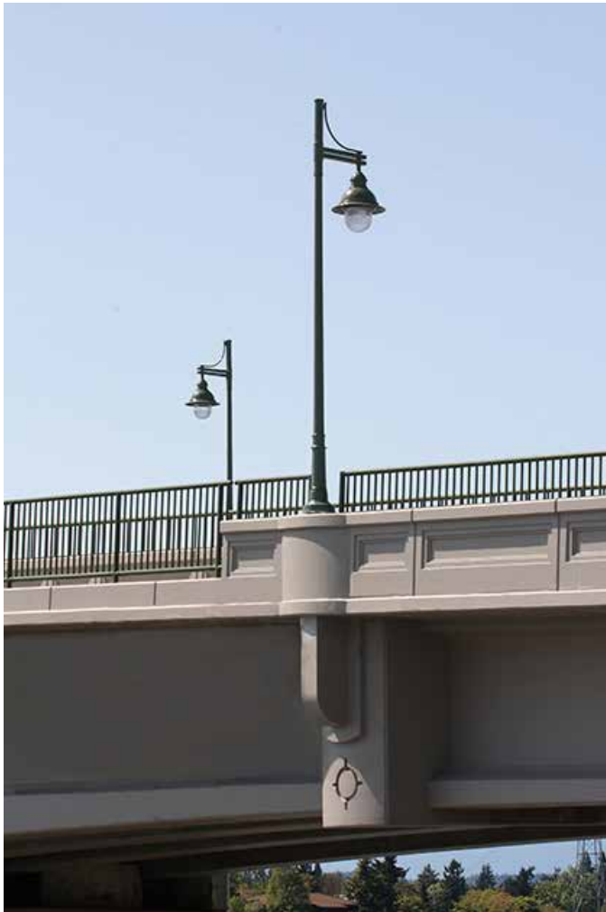
Architectural detail at the sidewalk.