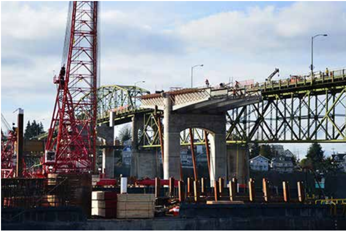
Hammerhead segments in place with existing bridge in the background.