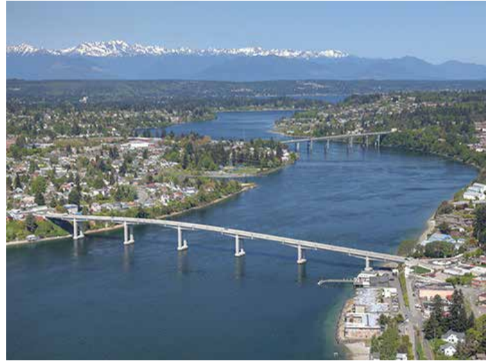
Aerial view of the complete bridge.