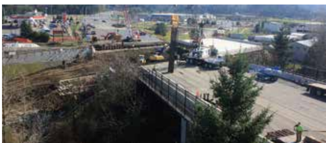
The old bridge has been removed and the new bridge is ready to be moved into place.