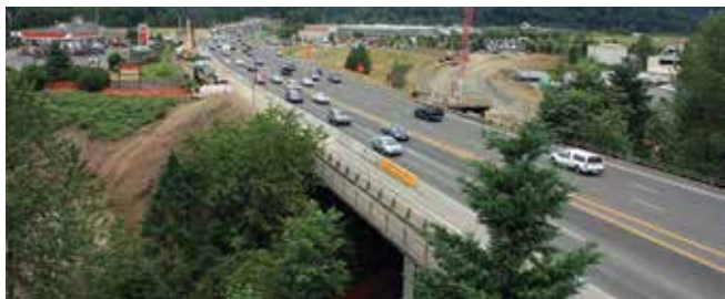
Construction of falsework for the new bridge begins on the right side.