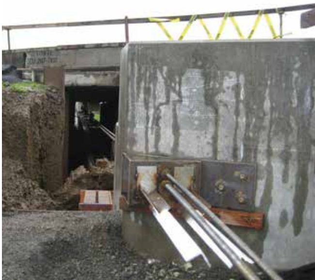
Tension rods are anchored at the abutment to create a reaction point. Note the bracket to accommodate the skew of the bridge.

threaded bars. Anchor points are needed to secure the jacks. Often, the jacks are anchored to the existing bridge beyond the replacement bridge being pulled into place.