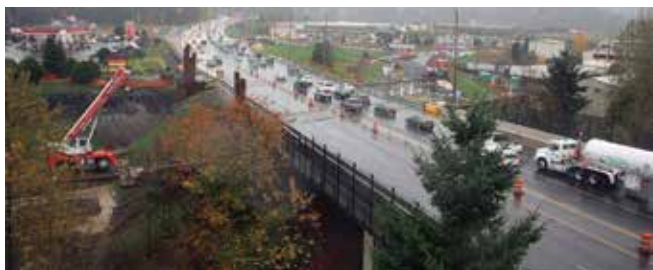
Construction of widened substructure begins on the left side.