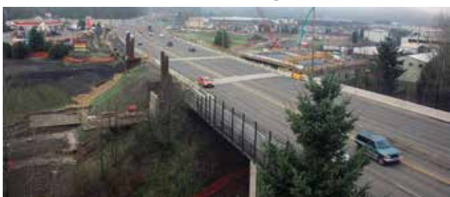
The deck is ready for casting concrete.