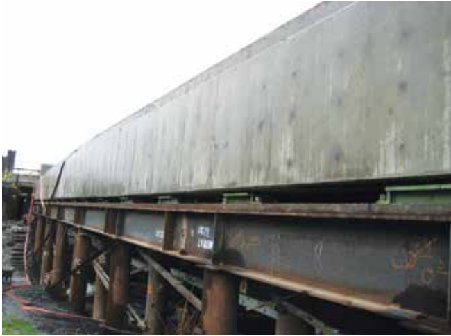
Rollers were used between the end diaphragms and the temporary substructure on the I-205 Redland Road overpass in Oregon.

Contractors using rollers must fully understand the tolerance issues, know the requirements to achieve the breakaway force, and monitor when to reduce the force once the bridge begins moving. These calculations must be precise, as any deviation can bind up the system and require time-consuming adjustment.