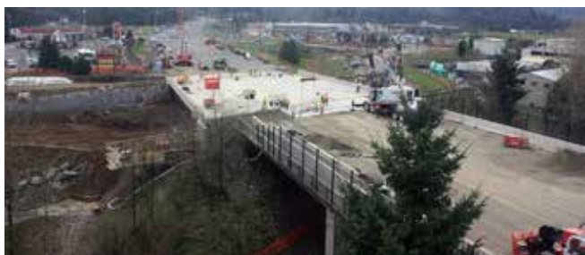
The new bridge is in its final location.

Sliding and rolling bridges into place offers key benefits to owners, designers, and contractors. As a result, more bridges are being designed and built using these techniques. This series of articles looks at some of the key considerations when using these approaches to construct bridges.