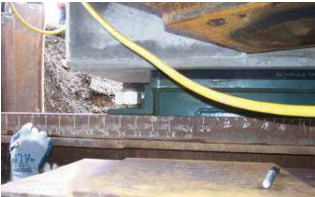
A simple measuring system is needed to monitor bridge movement at both abutments.

A trial-and-error approach, along with the use of a measuring stick along the rails, will best determine how far the bridge can be moved at once. If one side moves farther, however, adjustments must be made quickly. Workers should be assigned to each corner to watch the longitudinal and lateral movement carefully.