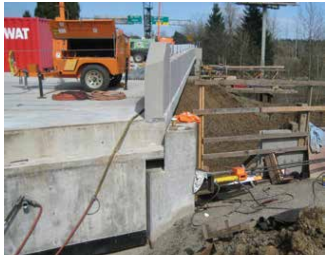
This before and after view shows how the abutment was changed once the bridge was moved into place. Note the channel guide rail and tension rods.