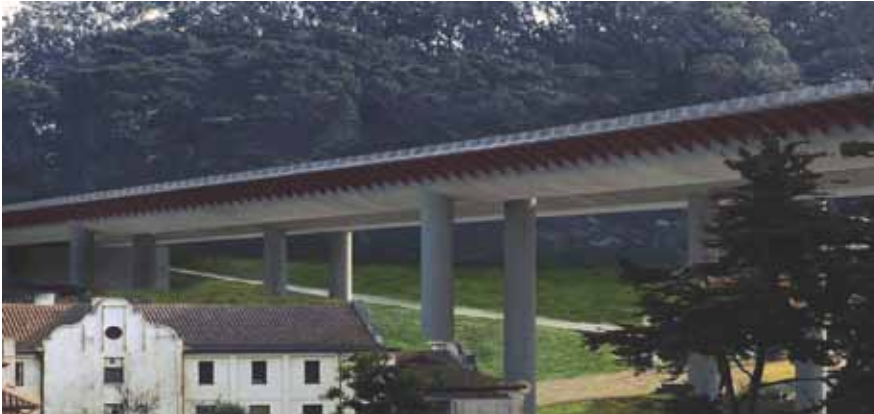
Rendering of the Presidio Viaduct.