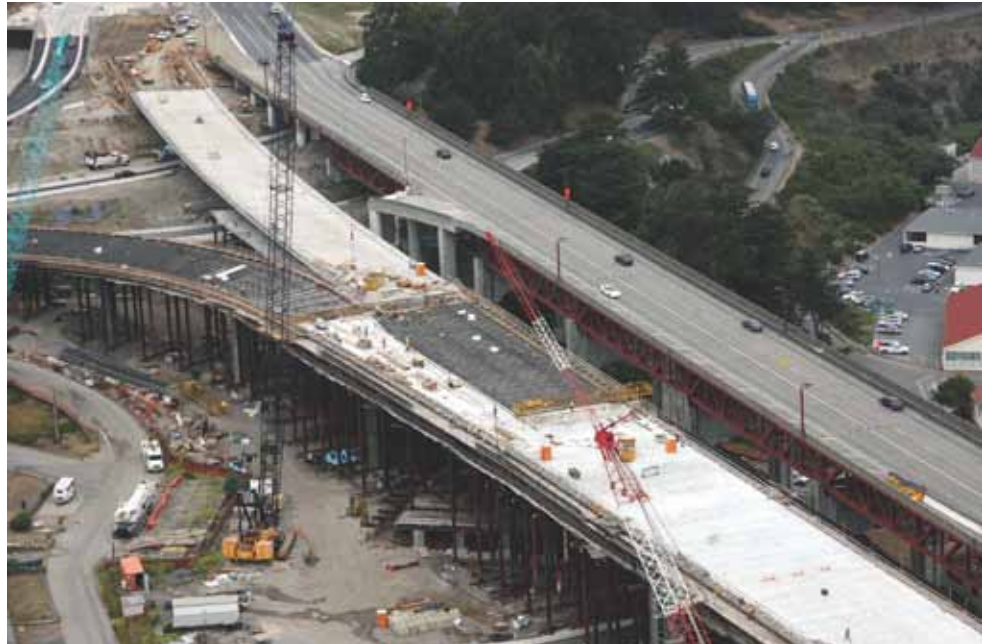
Aerial view of the Presidio Viaduct during construction. Doyle Drive is on the right and the Highway 1 Connector Bridge curves to the left.