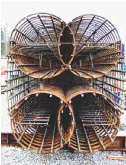
Unique reinforcement arrangement for the 8 by 10 ft rectangular columns.

1 by 3 in. flat ducts spaced from 2.5 to 4 ft. The jacking force varied from 131 to 175 kips. The structural steel fins were integrated with the formwork and cast monolithically into the cross section. The 256 fins are spaced uniformly approximately every 15 ft along each span.