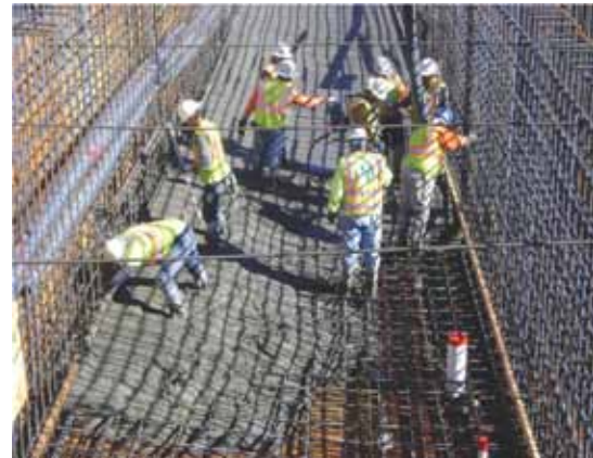
Placing concrete in the soffit of the box girder.