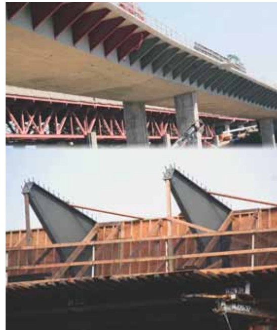
The steel fins that support the 14-ft-long cantilevers are shown in the structure and in place during construction of the concrete formwork.

Precast, prestressed concrete girders were used to span the culturally sensitive Presidio Pet Cemetery and support the falsework bents.