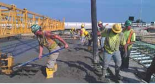
Concrete for the midspan regions of the Route 52 Visitors Center Bridge was placed independently of that over the piers by using transverse bulkheads.

constructed and used for the evaluation of the bridge. VCB was classified as an essential bridge in Seismic Design Category B. The loads generated in this analysis were used in the connection design at the piers as well as in the design of the VCB substructure and foundation. Seismic restraint blocks with armoring were provided at the end abutments.