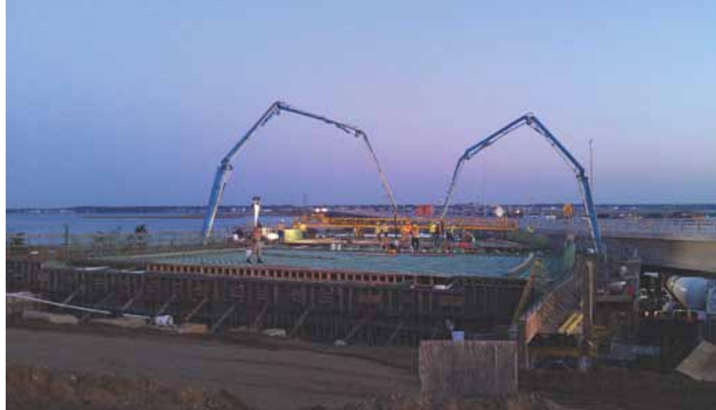
Two pump trucks were used to fill the Route 52 Visitors Center Bridge cross section as quickly as possible to avoid any cold joints.

Both two-dimensional and three-dimensional modeling were used. The first model involved the longitudinal analysis of the main solid box section. This time-dependent model constructed the VCB step-by-step and analyzed the structure for its entire design life to ensure that the superstructure remained in compression. Not only were dead and live load combinations considered in this design model, but also uniform-