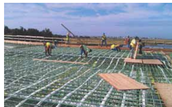
The Route 52 Visitors Center Bridge superstructure was post-tensioned longitudinally and transversely.