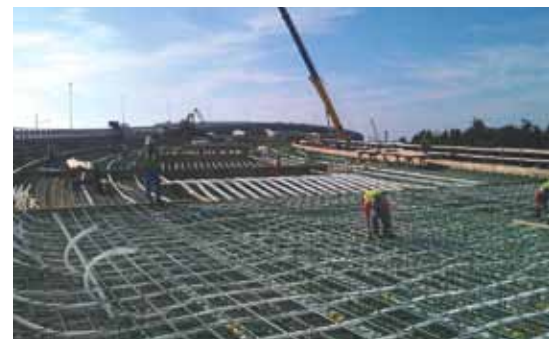
The path of the tendons in the Route 52 Visitors Center Bridge was parabolic in the vertical plane and curved in the horizontal plane.

Earthquake design considerations were also incorporated into this structure. A multi-mode spectral analysis was performed in accordance with the latest AASHTO requirements. A site-specific response acceleration spectrum was