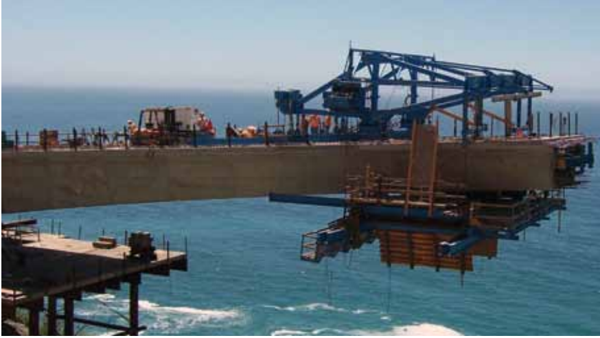
A form traveler was used to cast the 14-ft-long segments. After completing the south cantilever, shown here, the traveler was relocated to the north span cantilever.

at the bottom, each with an anchor head. Permanent steel casings 5 ft 6 in. in diameter are employed at all pier pile locations. Overall pile lengths vary from 69 to 95 ft; steel casing lengths vary from 19 to 35 ft; and rock sockets vary in depth from 50 to 60 ft. Extensive shoring was required to construct the main bridge piers.