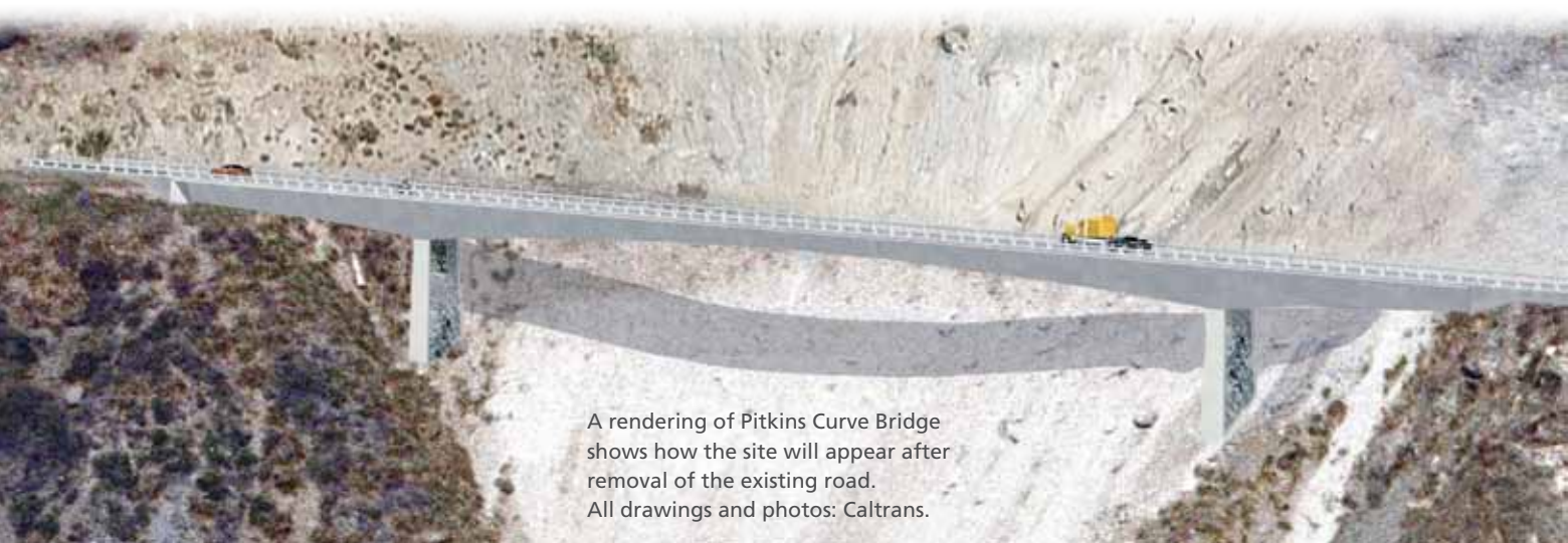
A rendering of Pitkins Curve Bridge shows how the site will appear after removal of the existing road.

The design selected for the Pitkins Curve Bridge is founded on geologically stable rock formations and spans the unstable slide region. The three-span, 620-ft-long structure carries two-way traffic. The structure has end spans of 154 ft 6 in. and a main span of 311 ft. The structure width at the deck level is 35 ft 6 in., with the roadway section carrying two 12-ft-wide lanes and two 4-ft shoulders. The traveled way is bounded by Type 80 concrete barriers with steel pipe hand railings affixed to the barriers for