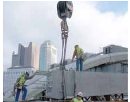
Delivery of the precast, prestressed concrete girders.

Following the inner rib tensioning operations, the eight deck segments closest to the abutments were placed on elastomeric bearing pads, and the outer rib segments were then tensioned the remaining 50%. All arch rib ducts were then grouted. The final eight deck segments spanning the middle two piers were then placed and the upper closure joints were cast using the same