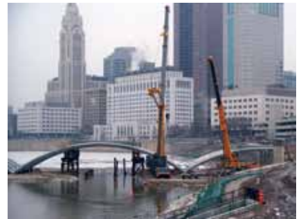
Snow flurries did not stop construction of the top segment of the rib arch on the Rich Street Bridge.