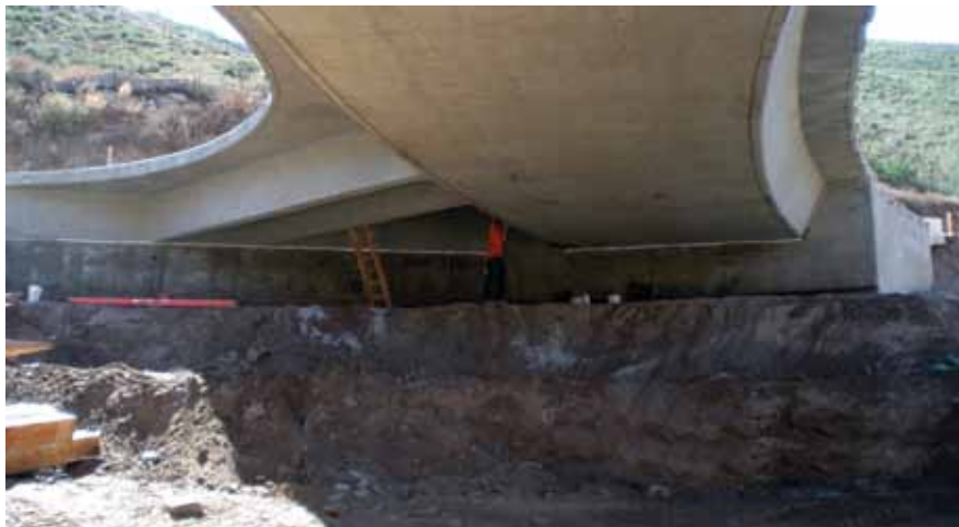
From below, shown is the framing between Sutherland Dam Road and Black Canyon Road.

A California Environmental Quality Act clearance with a Mitigated Negative Declaration document was processed and approved. The mitigation required the owner to obtain the necessary U.S.