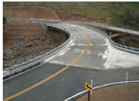
Intersection of Black Canyon Road and Sutherland Dam Road.

In order to maintain the original bridge footprint, engineers were creative in their approach to the design. They worked with the owner and Caltrans to develop special criteria for this rural road because the existing site constraints