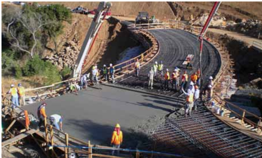
Deck placement using special concrete screed.

The most interesting design feature was the deck extension at abutment 1. Black Canyon Road intersects Sutherland Dam Road immediately adjacent to that abutment. In order to connect Black Canyon Road and Sutherland Dam Road, abutment 1 and the bridge deck surface had to be extended to the east with a reversing curve. That portion of the bridge deck was designed using two, 3-ft 9-in.-deep, concrete T-girders that extend from the exterior girder of the concrete box to the diaphragm of the extended portion of abutment 1. This deck extension support system prevented a major change in the bridge layout, but