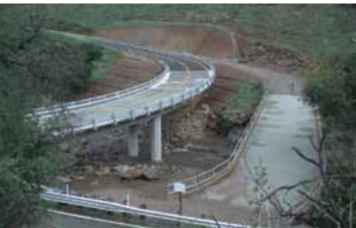
Looking north at the completed Black Canyon Road Bridge and the original structure. The original structure will be used by non-motorized traffic.

hoops at 6 in. on center for transverse reinforcement. The west wingwalls at both abutments are supported by a 2-ft-diameter CIDH pile due to their length, while the east wingwalls are typical cantilever-type wingwalls. The bridge is also located on the sag of a vertical curve and is superelevated with a 2% cross slope.