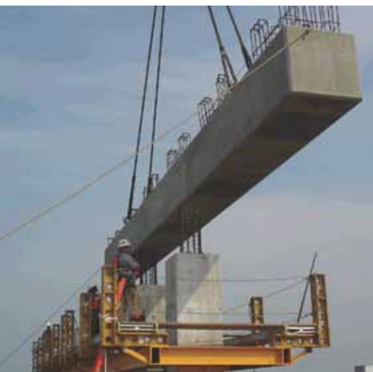
Precast concrete pile caps were used on the 36-in.-square piles in 496 bents.

Increased concrete cover and controlled permeability of the concrete mixes will extend the design life of the components for the bridges. The extensive use of high-performance concrete was a key element specified to ensure a 100-year design life for this project situated in brackish water. Design concrete compressive strengths ranged from 4500 psi to 8500 psi and the permeability threshold was set at a maximum of 1000 coulombs at 28 days. Other mix improvements included the use of Class F fly ash or ground-granulated blast-furnace slag for portland cement. A minimum of 5% silica fume was also required. Detailed curing criteria were established such as match-curing of test cylinders to establish the strength of precast elements at transfer of the prestressing force. In addition, temperature ranges were monitored for all mass concrete used throughout the project.