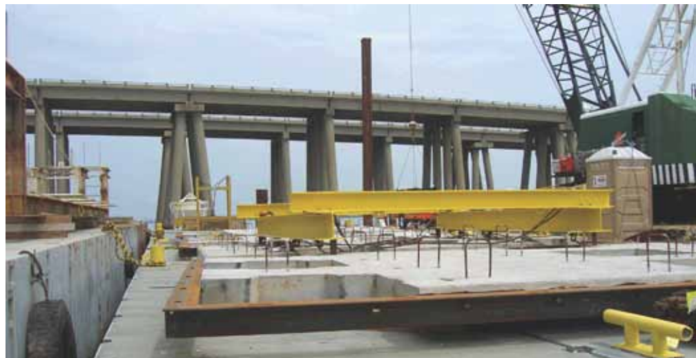
Precast concrete elements being readied for use as a stay-in-place footing form.

Whenever they could, the Contract 1 contractor elected to use a precast concrete pile cap alternate offered in the original design. Working with the precast manufacturer, Gulf Coast Pre-Stress Inc., and the owner, the original design was modified to accommodate vertical and batter piles, as well as the moment connection of the cap and restraining walls. The precast cap weighed about 80 tons and contained conventional nonprestressed reinforcement. These caps were used for the majority of the spans where span length, bridge width, and pile configurations were the same. Over 20,000 yd 3 of concrete were used in the 496 pile caps.