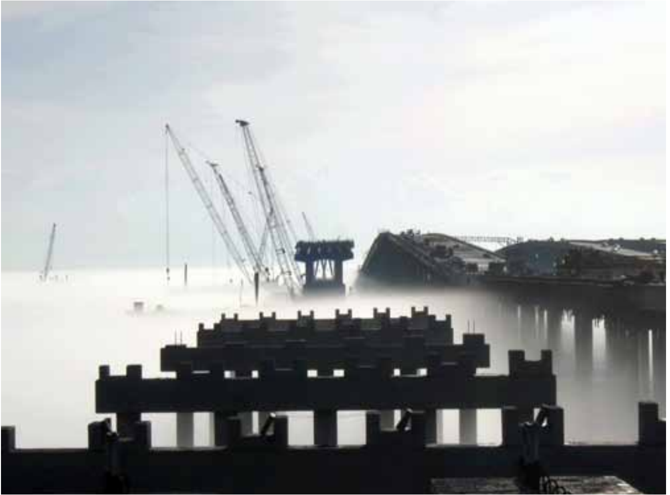
Fog envelopes construction of the twin spans of the I-10 replacement bridges over Lake Pontchartrain, La.