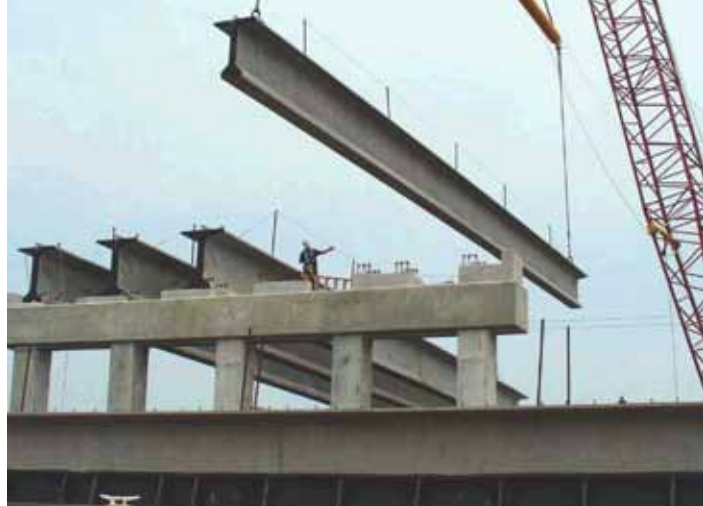
The typical spans included 135-ft-long, 78-in.-deep Florida Bulb-tee beams set on precast pile caps on 36-in.-square, hollow, precast, prestressed concrete piles.