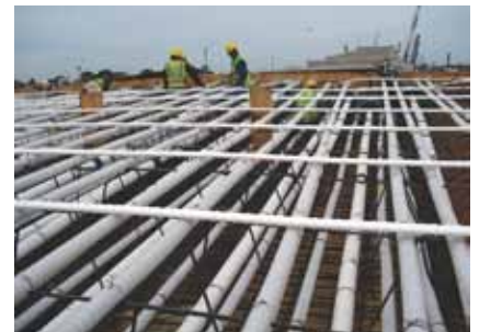
View of casting bed showing large number of post-tensioning ducts and ready for concrete placement.

segments moving in the desired direction as they were launched.