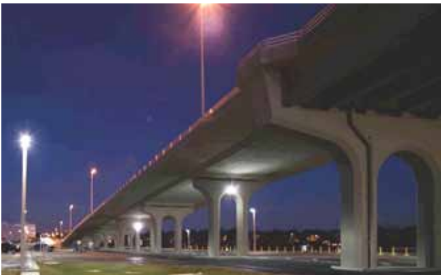
View of the east approach slab from the boat ramp park below the bridge.