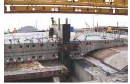
Launching post at back end of segment.