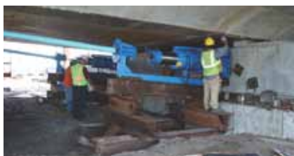
Launching jack in front of the abutment.

Temporary sliding bearings, consisting of 1/2-in.-thick reinforced neoprene with a Teflon coating, were used to allow the segments to slide over the stainless steel plates on top of the pier supports. The launching crews fed the temporary sliding bearings between the superstructure and the top of the steel plates during the launching. Lateral guides on the end bents and pier supports were installed to keep the