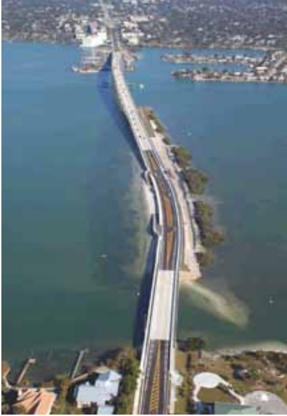
Belleair Beach Causeway Corridor showing the two new bridges following completion.