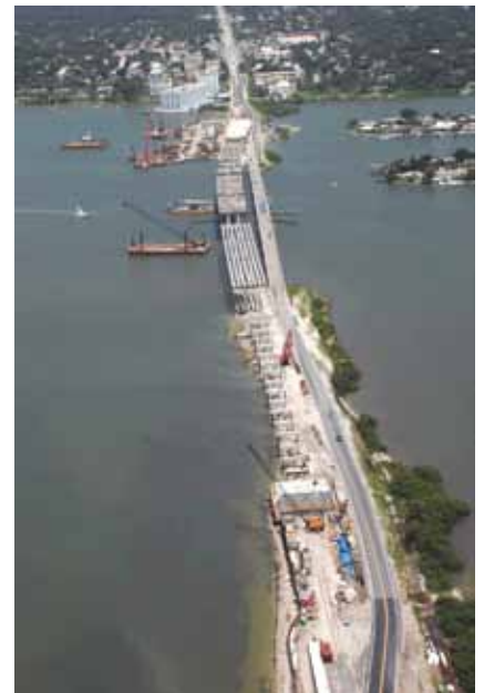
The west approach showing launching pad, permanent and temporary piers, and access issues.

Two 500-ton launching jacks with a stroke of about 10 in. were used in