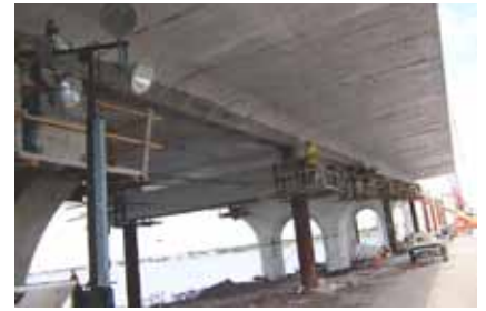
Slab segments slide over pier supports.