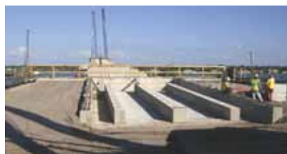
Launching pad before forms were installed.