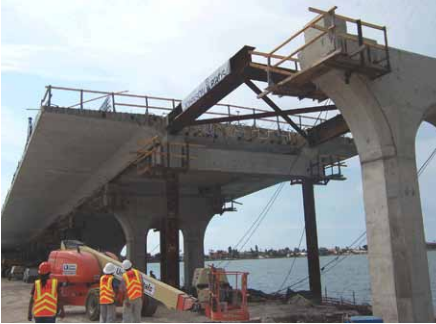
Launching nose at front of segment as it passes over a temporary pier and approaches a permanent pier.