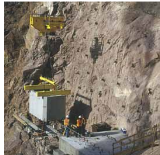
The first precast pier segment, supported by the high-line crane is erected on its footing.

Initial bridge construction began with footing and abutment work, and in the precast yard outside of Boulder City where the contractor set up their own facility to precast the columns. Column segments were trucked to the site as needed for erection, and set into place using both the high-line crane and conventional cranes located at the highway hairpin in Nevada.