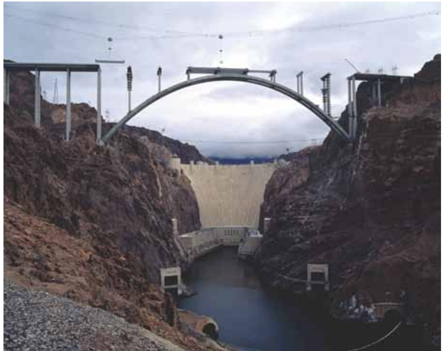
Following closure of the arch, the spandrel columns were set using the high-line crane. Superstructure girders are shown being erected.

The composite steel-concrete superstructure was selected for speed