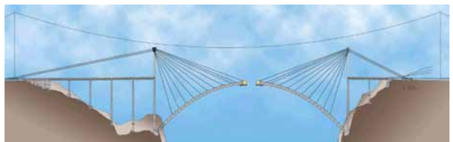
An illustration to show the use of cable stays to construct the arch segments and the position of the high-line crane.

The tallest of the tapered spandrel columns is almost 92 m (302 ft) tall.