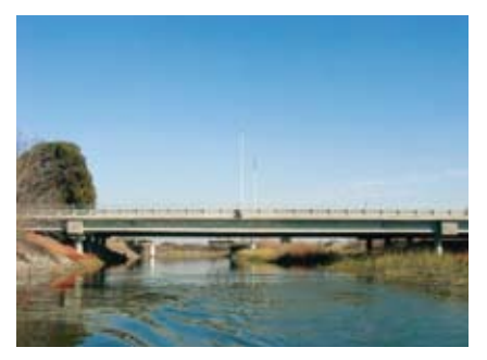
The Daggett Road Bridge environmental constraints played a key role in determining the type of bridge.

Sustainability has received vast awareness recently, specifically related to the impact that humans have on the earth's resources and environment. This attention is being focused on every