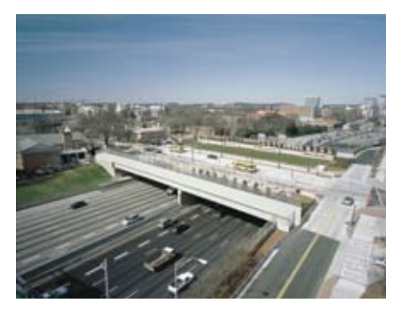
The Fifth Street Pedestrian Plaza Bridge in Atlanta provided a pedestrian-friendly environment.

aspect of our built environment; the homes we live in, the buildings we work in, the cars we drive, and the roads we drive on. Is sustainability just the next buzzword or fad? Considering how many aspects of our lives are affected, most authorities believe sustainability will become a driving force that permeates all facets of our lives.