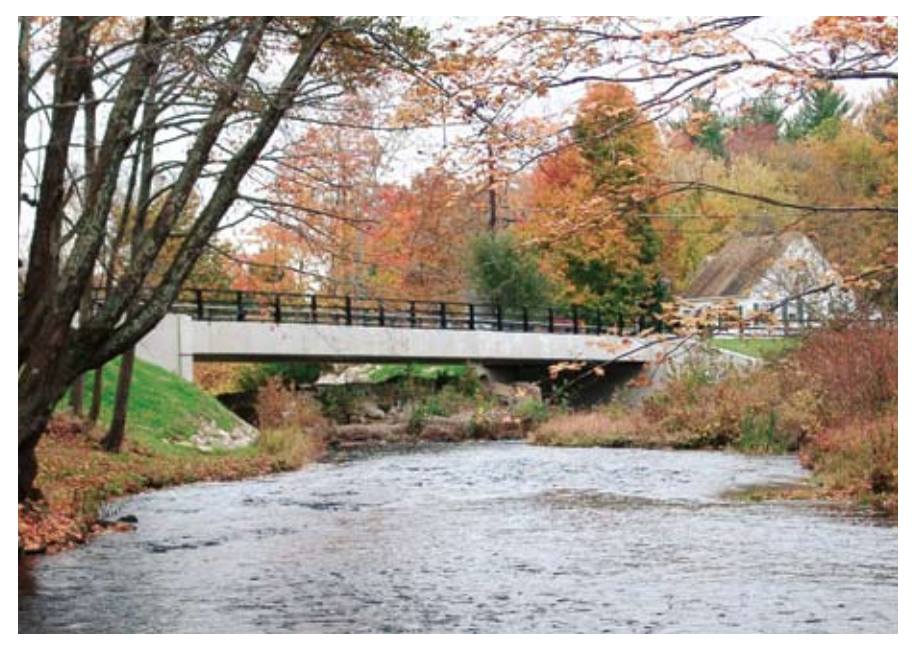
The Mill Street Bridge in Epping, New Hampshire, was built in only 8 days to minimize construction-related traffic delays and improve work zone safety.

The building sector, through the U.S. Green Building Council, has developed and published a highly recognized