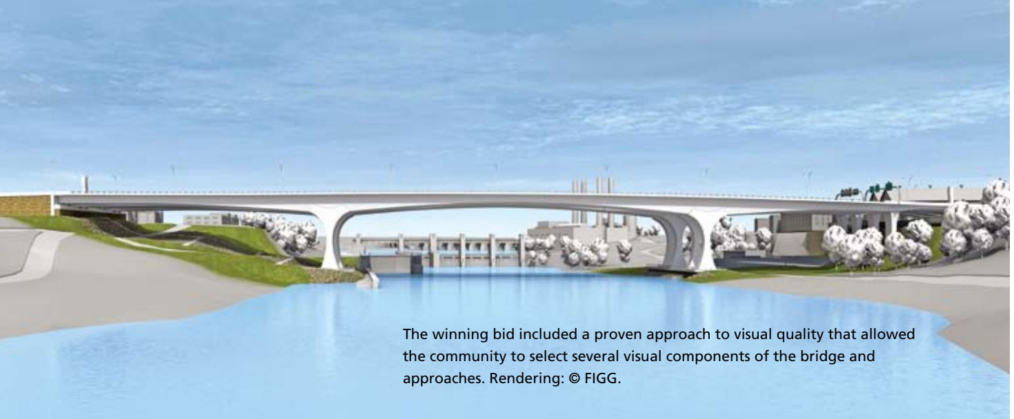
The winning bid included a proven approach to visual quality that allowed the community to select several visual components of the bridge and approaches. Rendering: © FIGG.