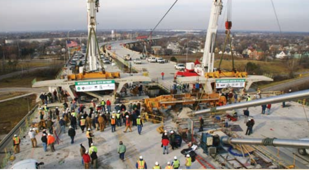
Work nears completion just prior to the erection of the final segments.