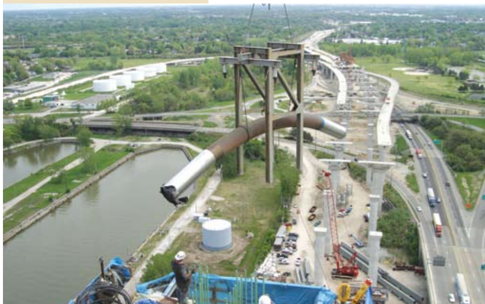
Lifting a cradle into place on the pylon.

Concrete for all superstructure segments, the piers, and the pylon was specified to have a maximum permeability of 1000 coulombs at 28 days and a plastic air content of 5 percent. The superstructure segments included a 1.5-in.-thick integral wearing surface, cast with the segments and post-tensioned along with the