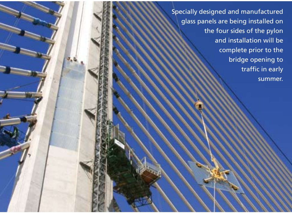
Specially designed and manufactured glass panels are being installed on the four sides of the pylon and installation will be complete prior to the bridge opening to traffic in early summer.