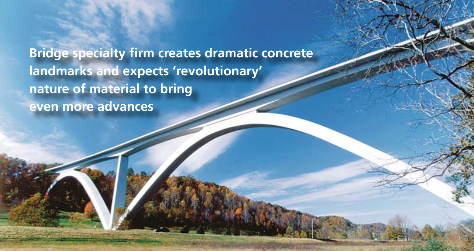
The Natchez Trace Parkway Arches, Tennessee.