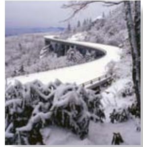
Blue Ridge Parkway Viaduct around Grandfather Mountain, North Carolina