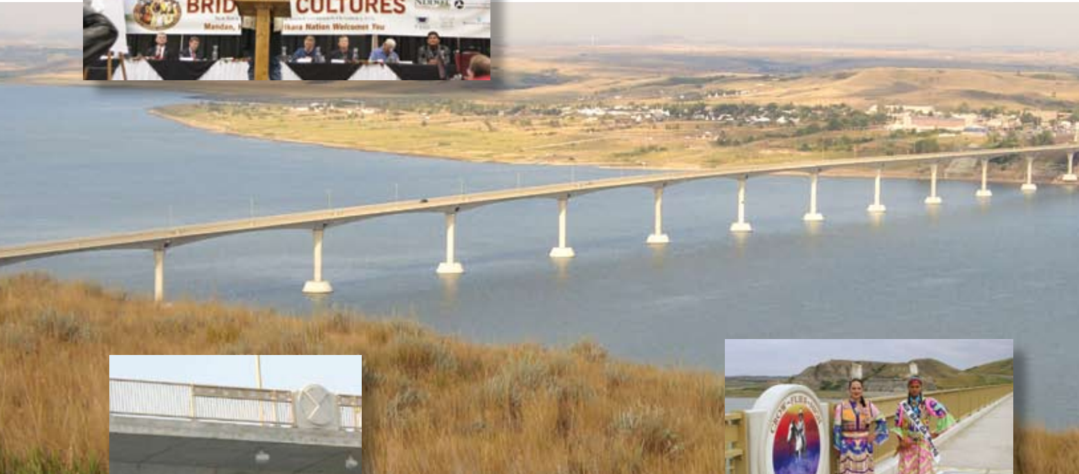
Two members of the Three Affiliated Tribes pose with a Four Bears Bridge sidewalk monument (Below Right).