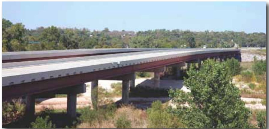
The longest precast, prestressed concrete spans in the state are featured on the SH 4 Bridge over South Canadian River between the towns of Mustang and Tuttle. The 1751-ft-long bridge has 12 spans of Type J Texas bulb tees, each 146 ft long.

The Eight-Year Construction Work Plan had created credibility with the public and the legislature.