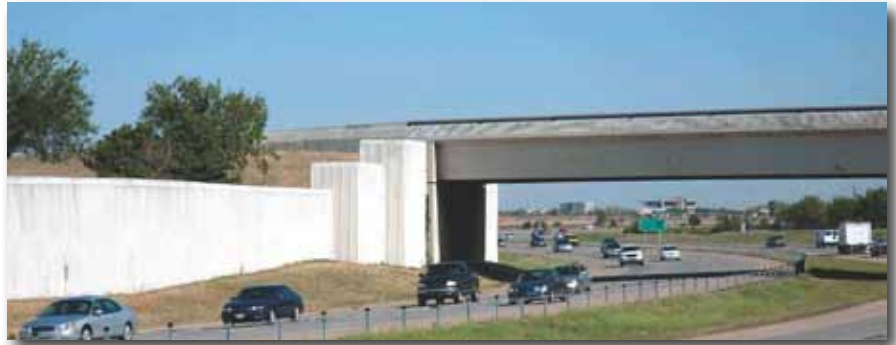
The 215-ft-long, single-span, Lake Hefner Parkway Bridge in Oklahoma City features Oklahoma’s second longest concrete span. The cast-in-place concrete, box girder structure spans the parkway without a center pier.