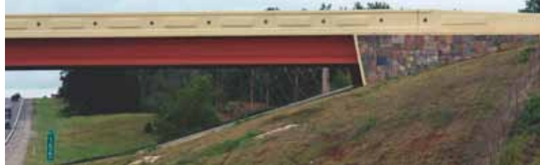
The two-span, precast, prestressed concrete SH 102 Bridge over Turner Turnpike near Wellston was the state's first structure to feature a special aesthetic treatment consisting of colored components and an embedded concrete theme cap at the juncture of the center pier and superstructure.