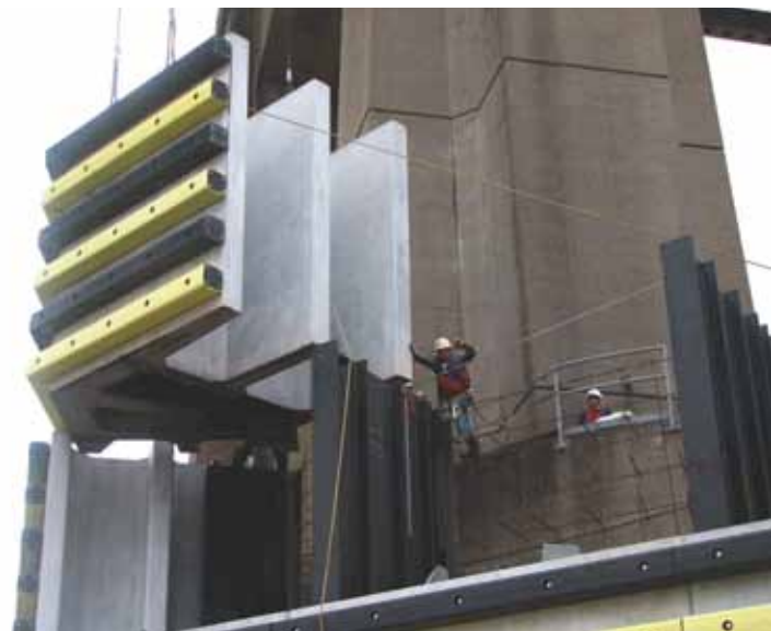
A corner module being slid into place for the Pier 5 fender.