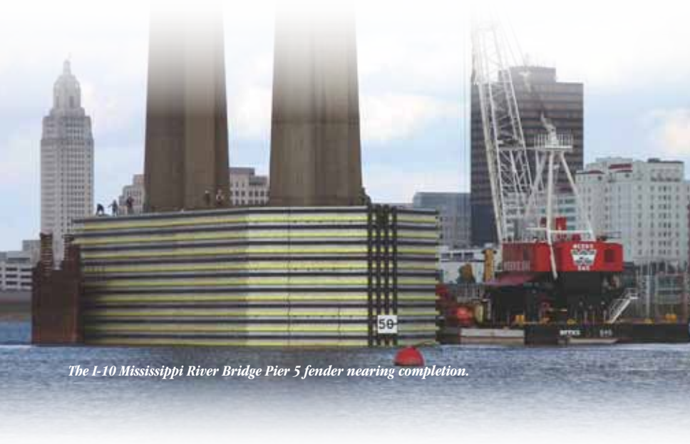
The I-10 Mississippi River Bridge Pier 5 fender nearing completion.

by Richard Potts, Standard Concrete Products