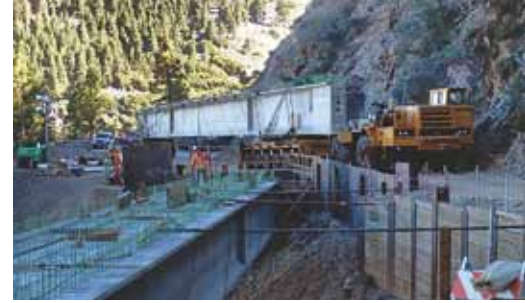
An assembled spliced girder is shown being driven over Abutment 1.

A special tractor and trailer were required to transport the girders from the staging area to the bridge site through several sharp turns.