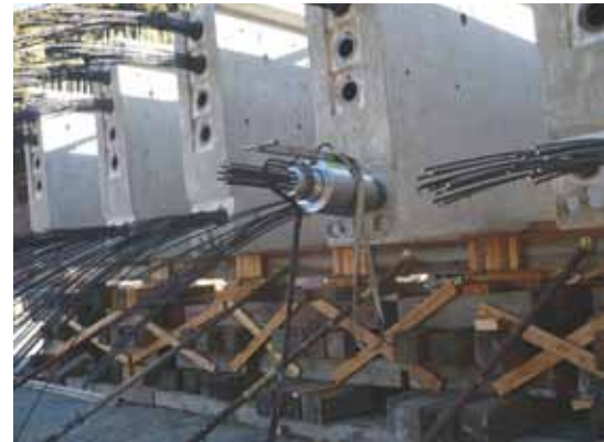
The first stage post-tensioning was done in the staging area. The bottom tendons needed to be stressed simultaneously from opposite ends of the girder to prevent eccentricity.