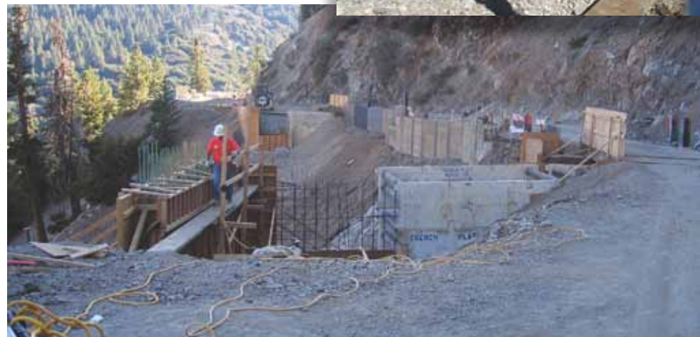
The temporary haul road crosses the uphill end of the abutments to allow delivery of materials including the assembled girders. Note the braced forms and bridge over the forms. Once girders were delivered, the road was removed and the full abutment unearthed.