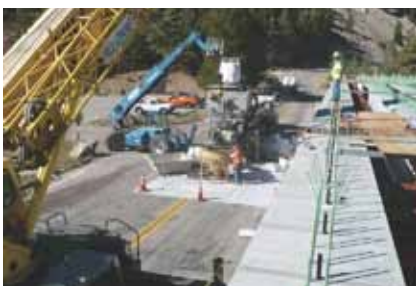
At the staging area less than a mile downhill from the bridge, girder segments were aligned and forms placed for the closure joints.

A staging area was established less than a mile downhill from the bridge site to receive the individual girder segments that arrived from the precasting yard.