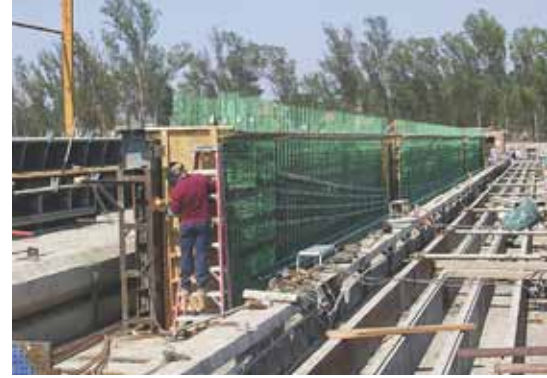
The girder is shown in the Pomeroy casting yard prior to installing the steel side form. All three segments for one girder were cast at one time.

At the bridge site, the abutments were constructed and one end of each partially buried to allow the haul truck to drive over them and move the girders into position near the cranes. The girders were unloaded onto the abutment seats with flanges nearly touching one another. After placing all the girders on the exposed portions of abutments, the buried portion was cleared. Next, the temporary haul road which occupied the same space as part of the abutments and superstructure was removed. Finally, the cranes spaced the girders in their final positions along the abutments.