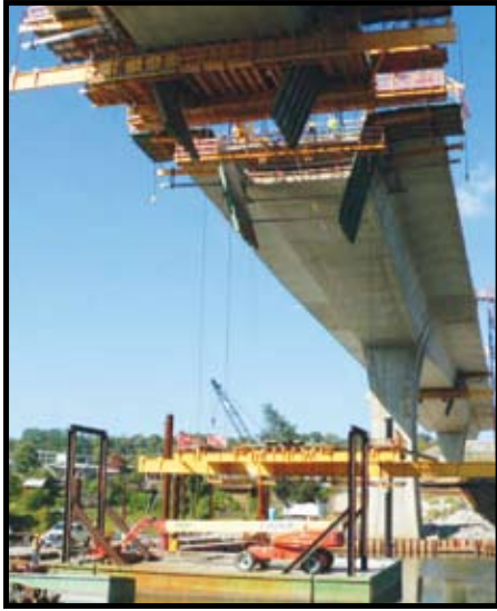
Concrete segmental cantilevers meet to form one of the 380' spans