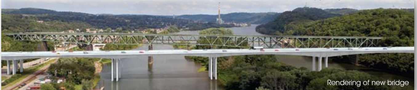
Rendering of new bridge